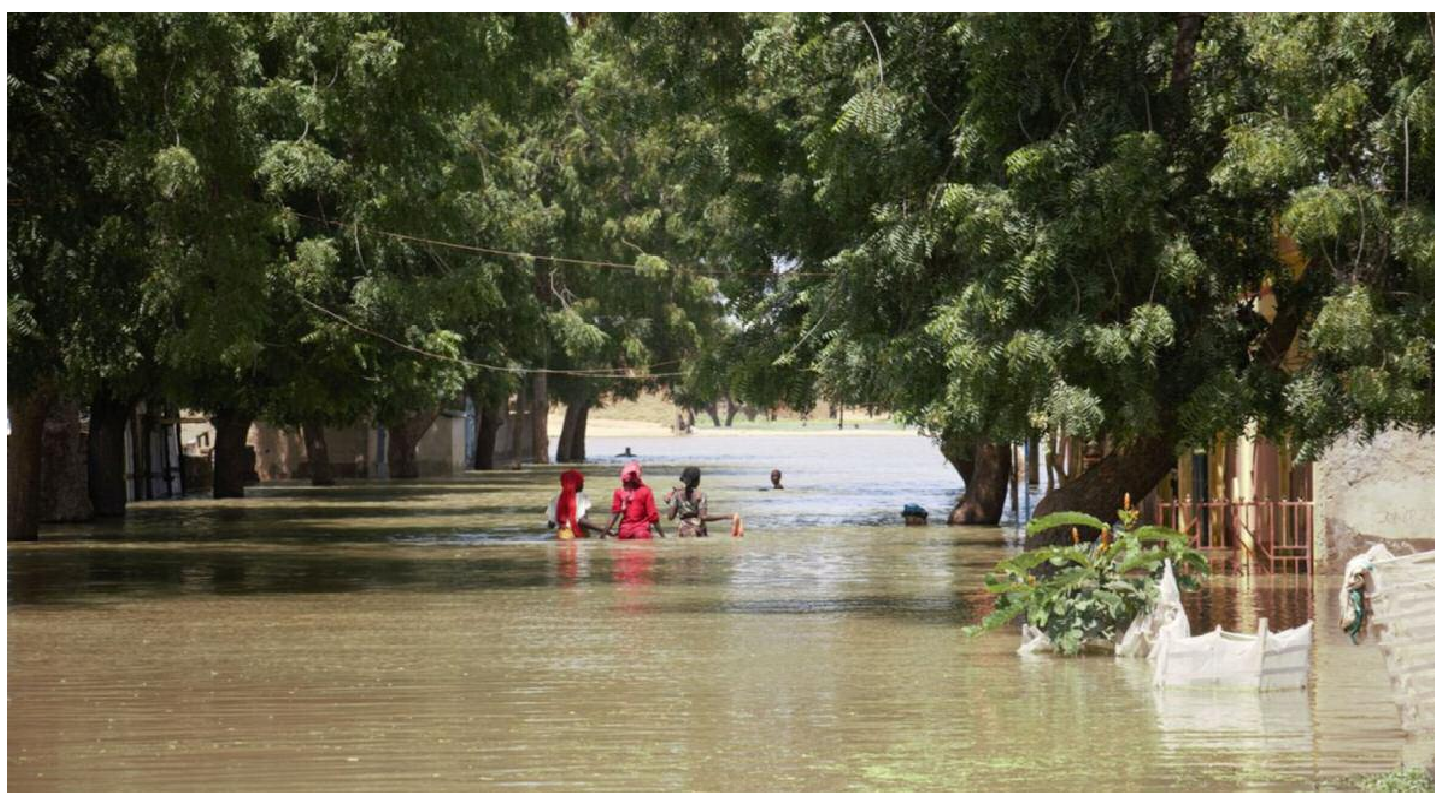
Some inhabitants fleeing their homes as floods ravage village