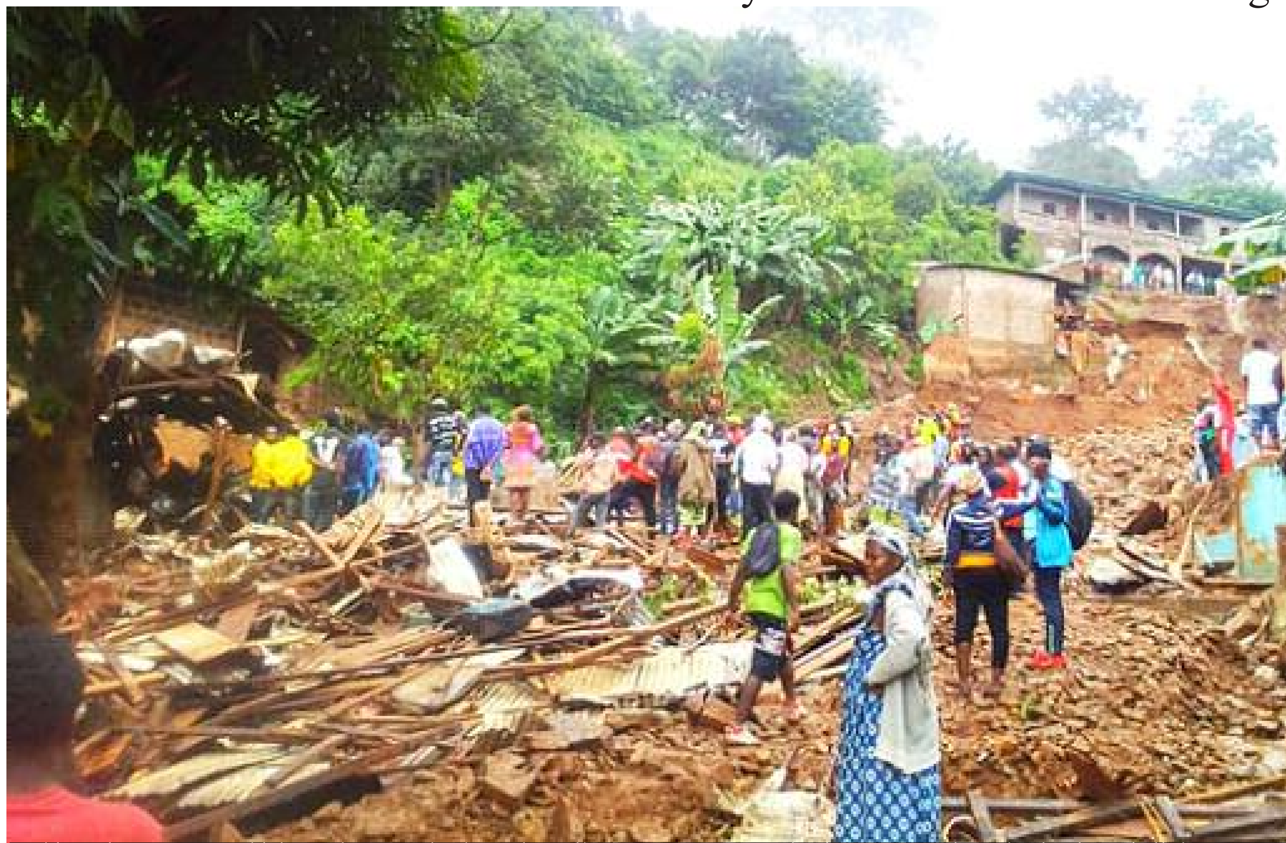
File photo: Bewildered population battling to rescue victims at Mbankolo landslide scene