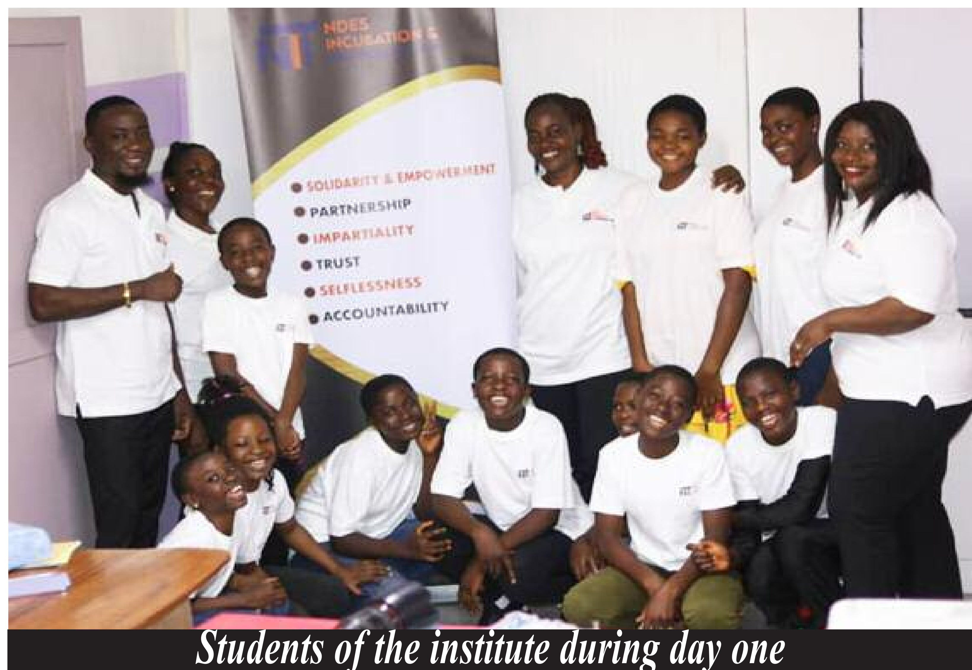
Students of the institute during day one