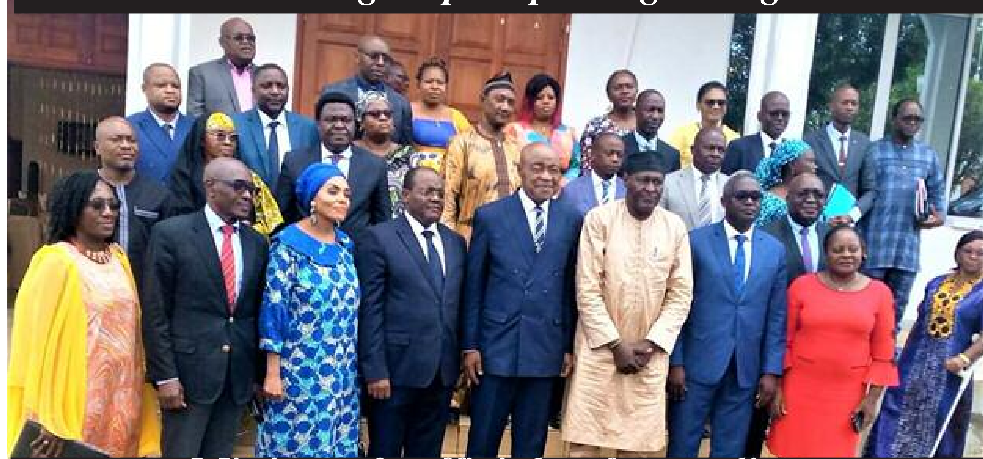
Minister & officials after audience

will use the festival to promote peaceful co-existence and living together as propounded by the Head of State, President Paul Biya.