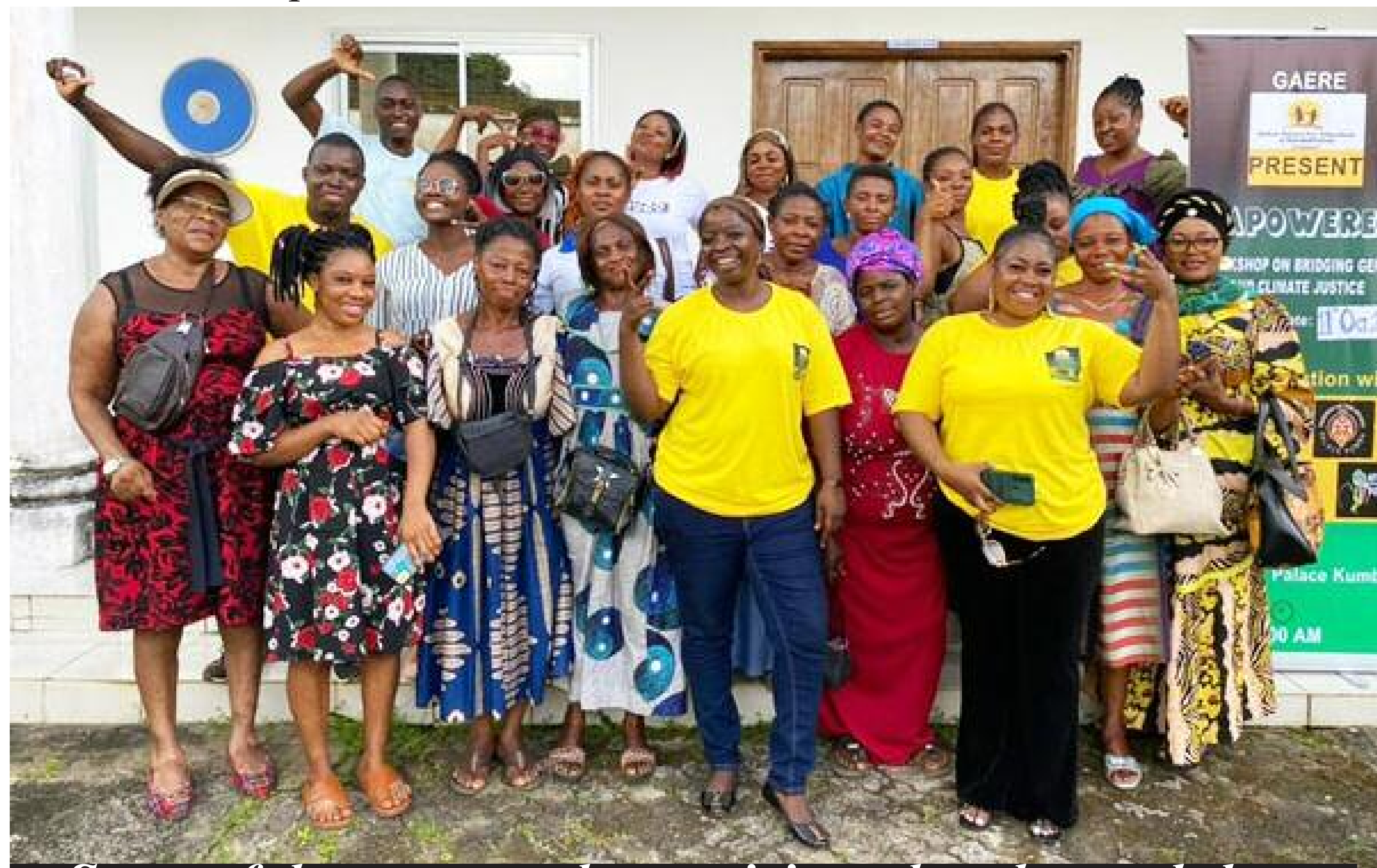
Some of the women who participated at the workshop

She thanked the Kumba-based non-governmental organisation, Global Action for Education and Rehabilitation, GAERE, for coming up with the lofty initiative to enlighten them on GBV and climate justice issues.