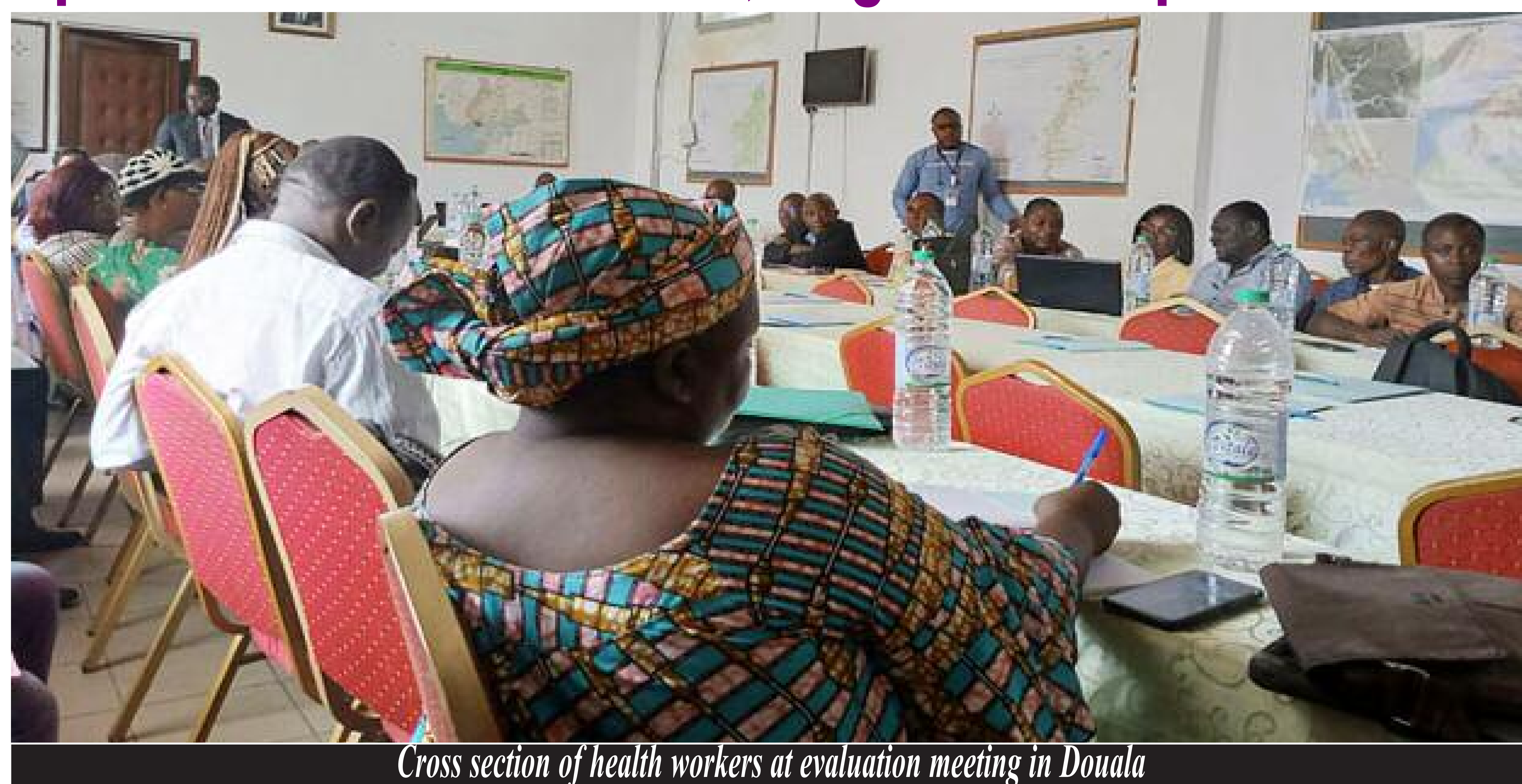
Cross section of health workers at evaluation meeting in Douala

They cause immense suffering by weakening the immune system and can be fatal. They most often affect the