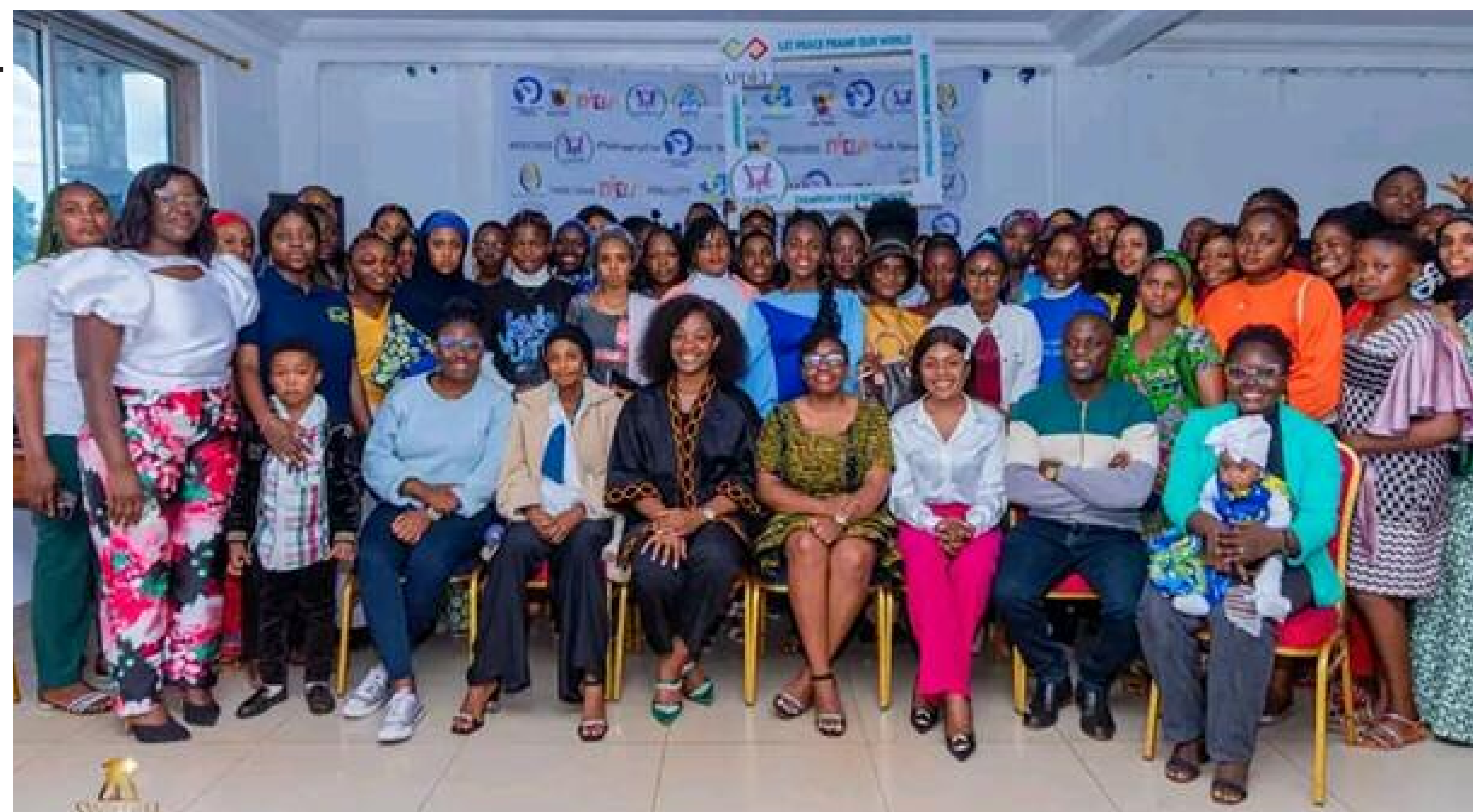
Cross section of participants and experts at the workshop in Bamenda