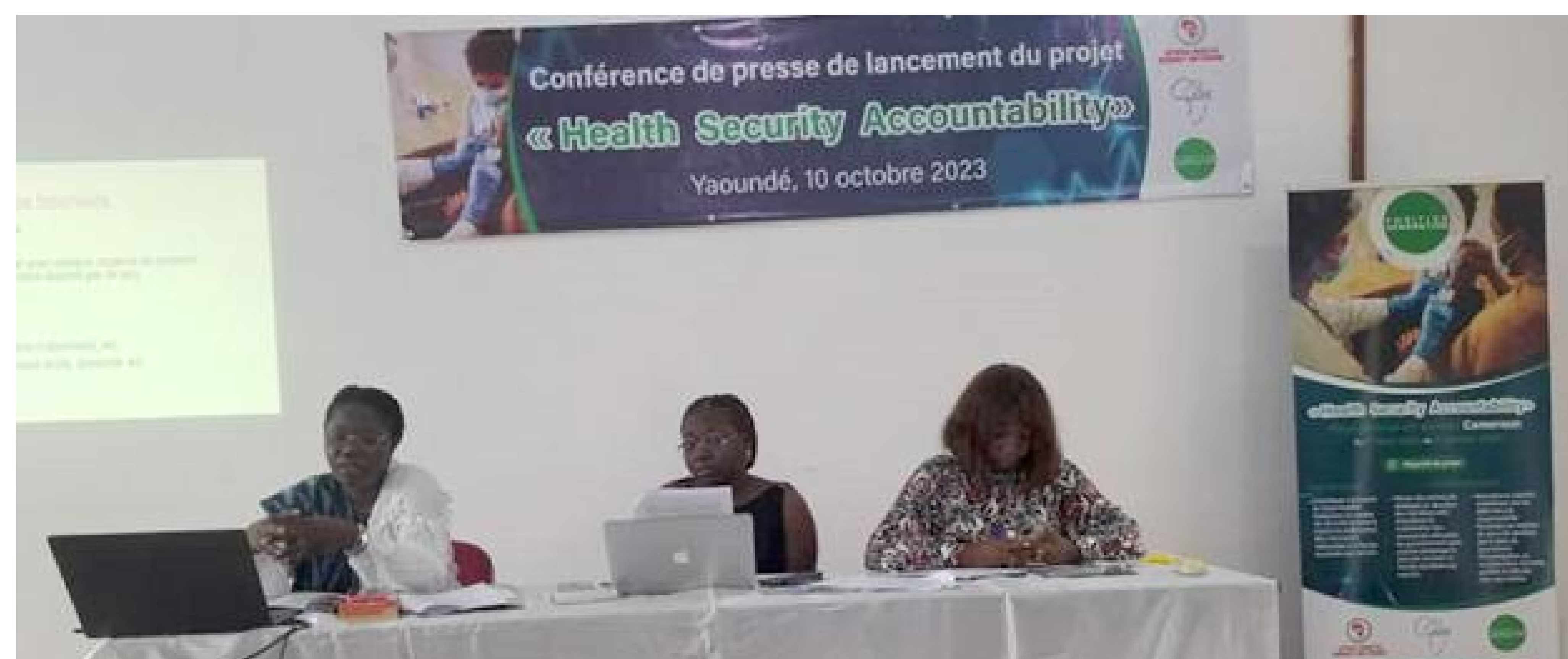
Panel presenting project during presser

In 2022, they said it dropped to 3.7% in 2022. To reverse the trend, officials of the organisations implementing the project said there is need for collective effort.