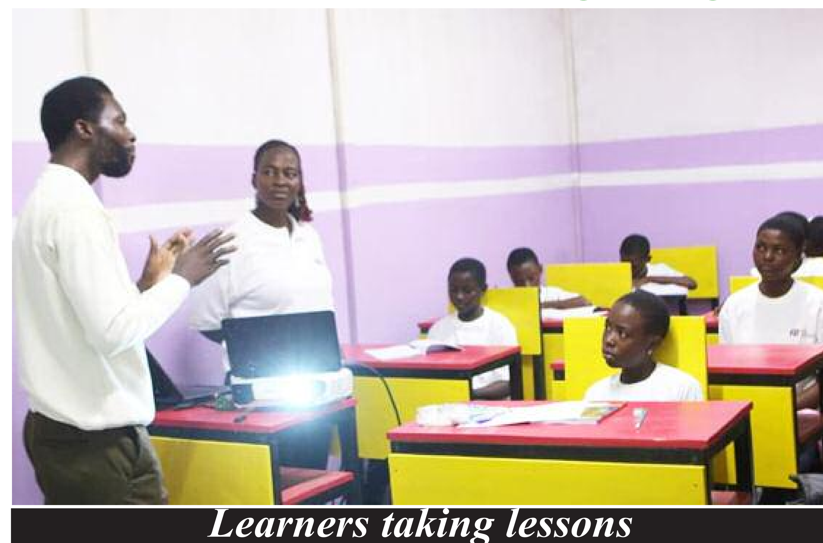
Learners taking lessons

"NDES Foundation is also eager to partner with and learn from like-minded organisations with a commitment to community development and empowering girls. This collaborative spirit is the driving force behind