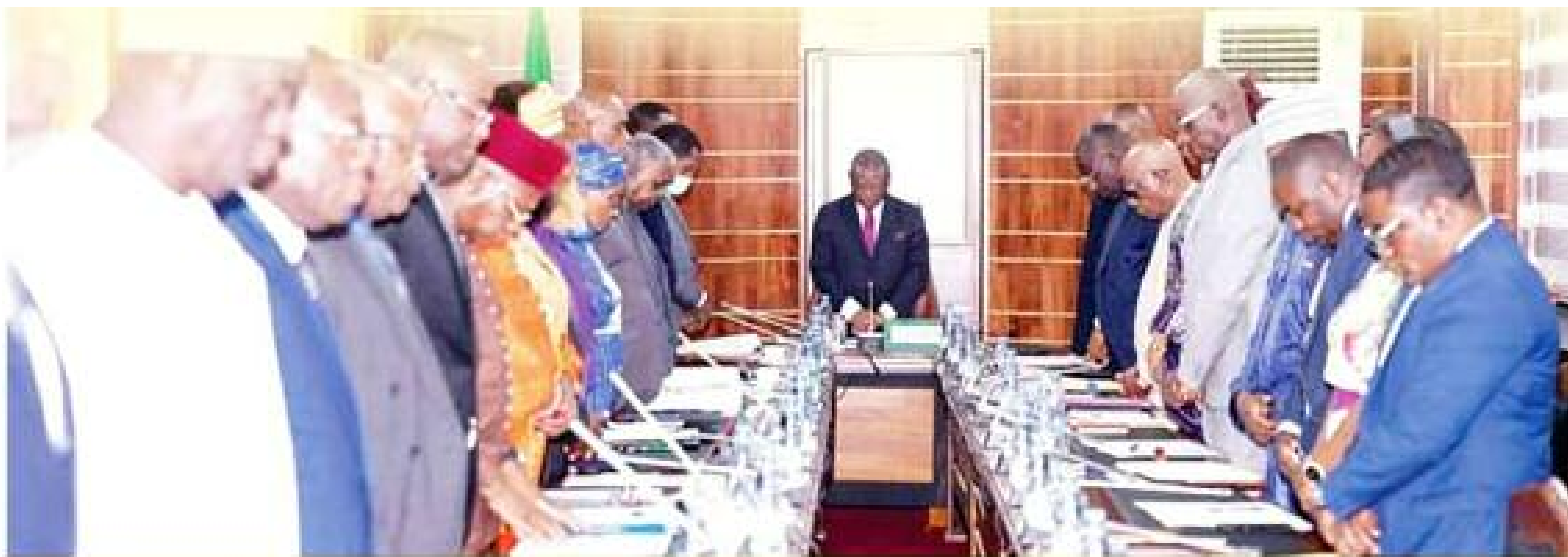
PM Dion Ngute, members of gov't observing minute of silence at start of meeting

lies...they have had relief materials. Those who were in hospitals have been taken care," Territorial Administration minister, Atanga Nji, told reporters at the end of the meeting.