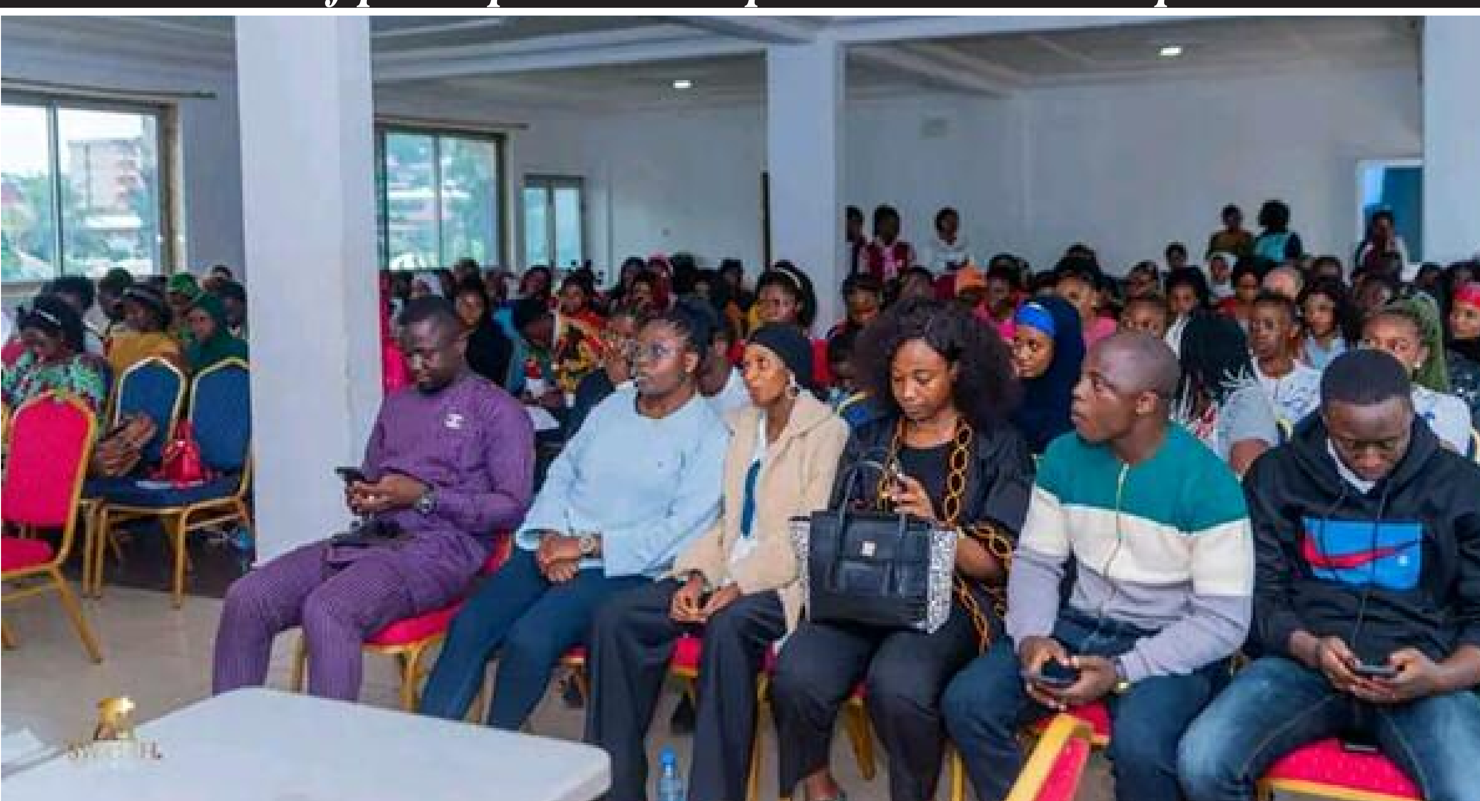
Participants following discussions during workshop

Girls and Young Women, argued that encouraging the girl child comes with benefits such as increase productivity.