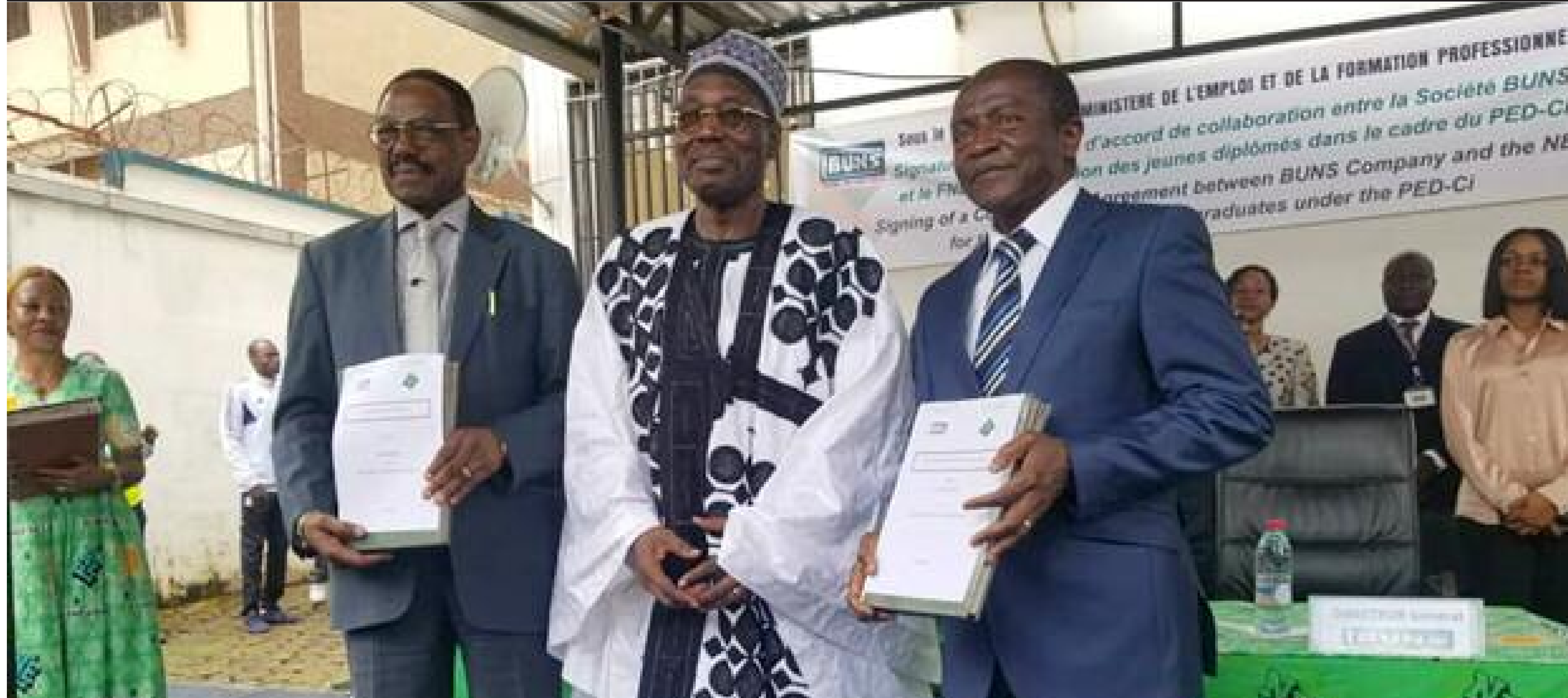
NEF & BUNS officials pose with Minister Issa Tchiroma while brandishing signed agreement

Tchiroma lauded NEF's relentless fight against unemployment and the socio-professional integration of young graduates. NEF, he added, remains the pillar in the fight against unemployment in the country.