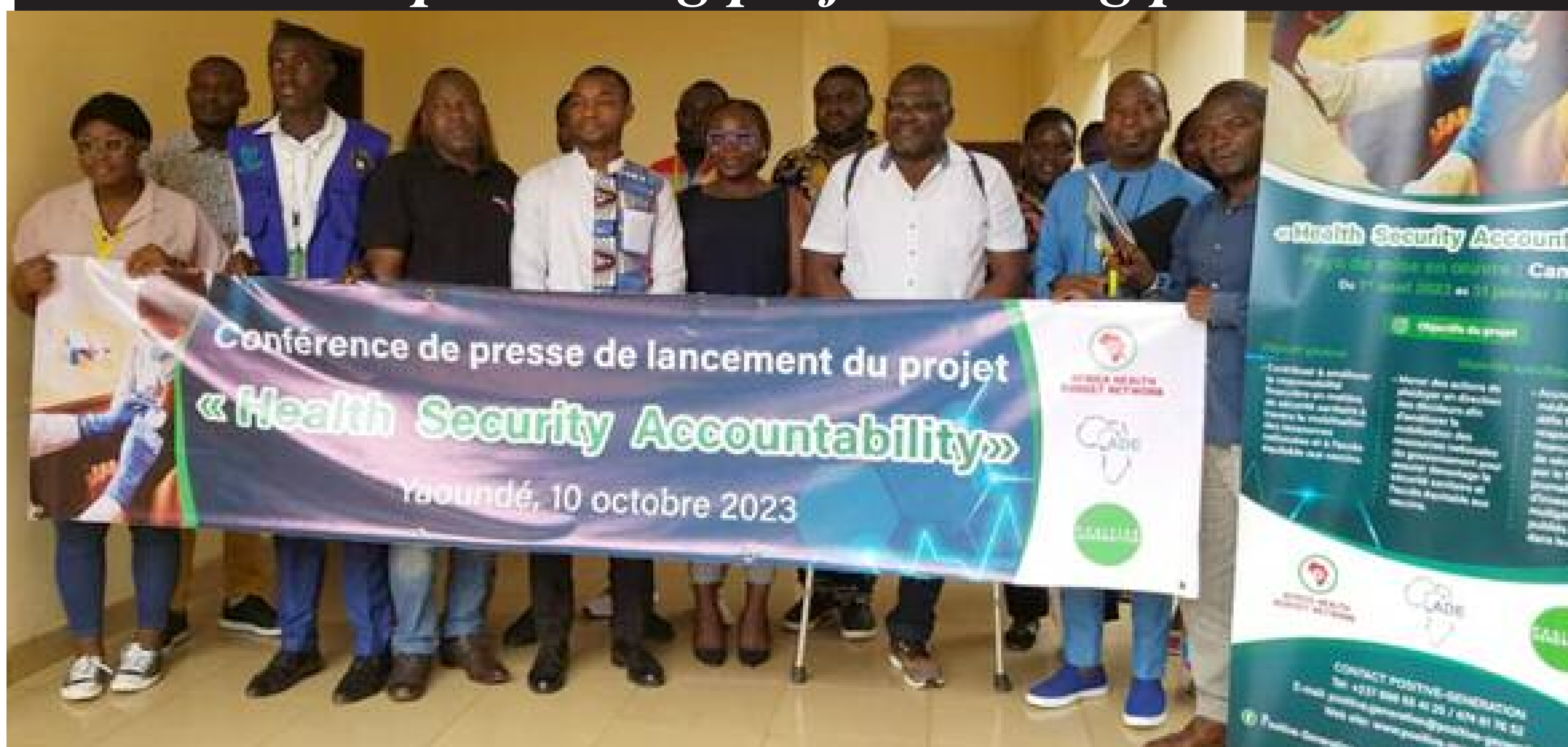
Organisers, participants at project presentation