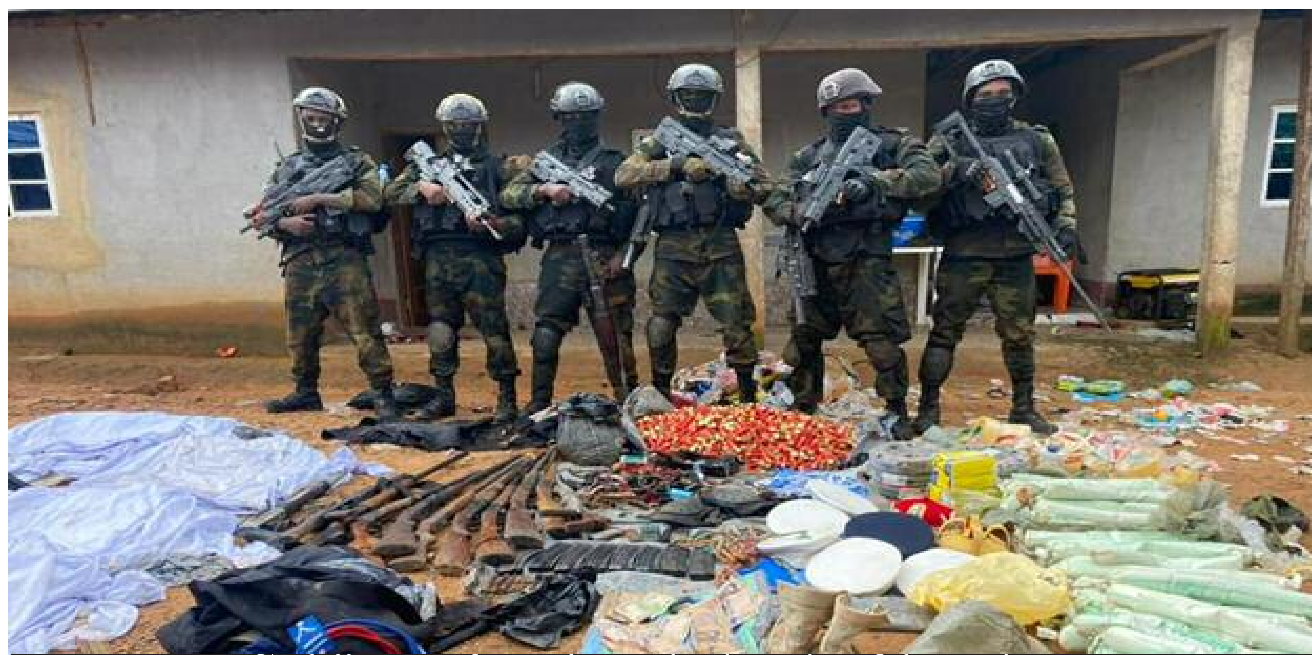
Soldiers after the mission in Obonyi III

The administrator has called on the population to continue to collaborate with the forces of law and order in the Subdivision for normalcy to return.