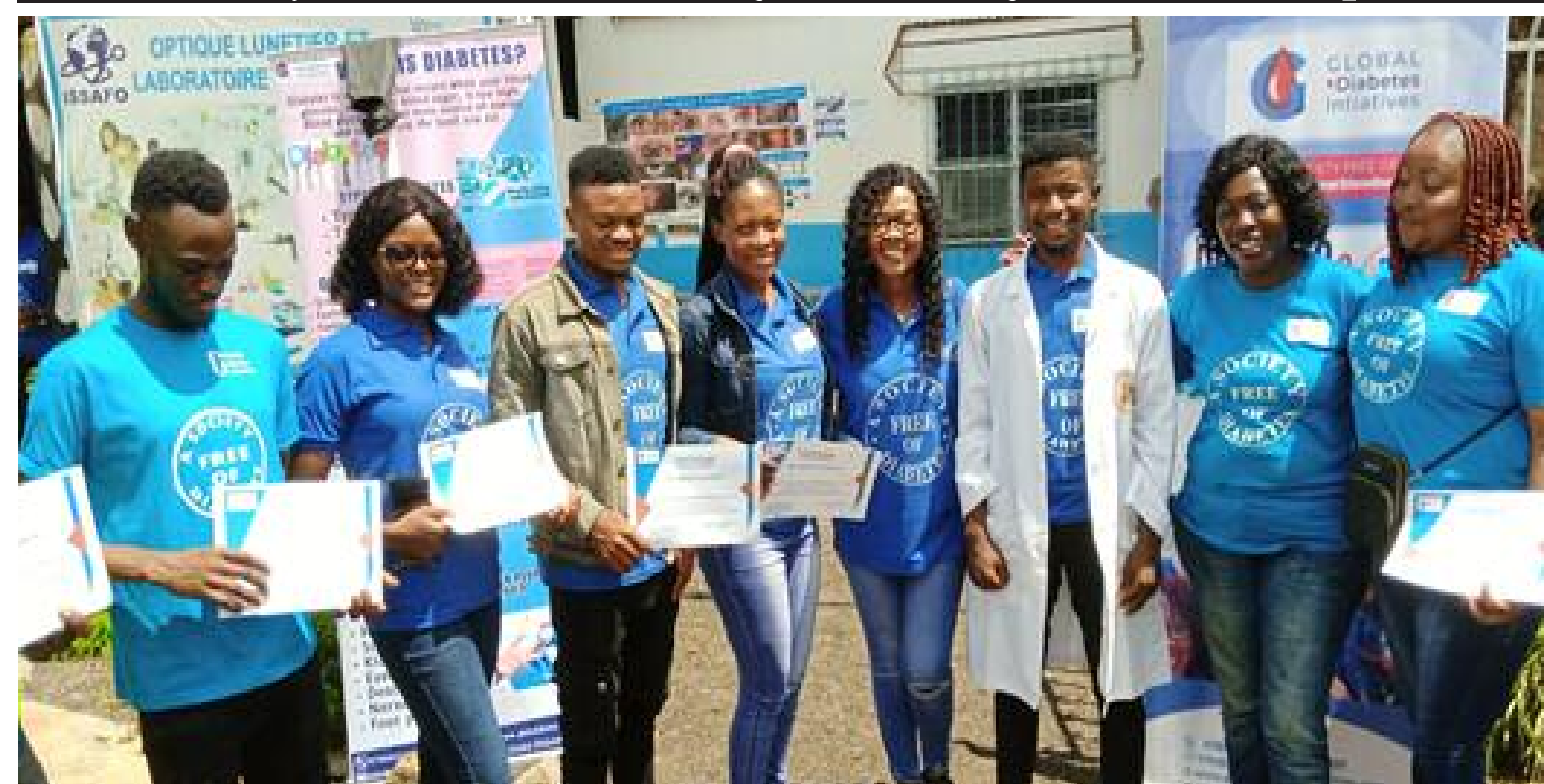
Founder & volunteers brandishing certificates

The event ended with the award of certificates of participation to volunteers. Those who benefited from the initiative also thanked the organisation for coming to their rescue.