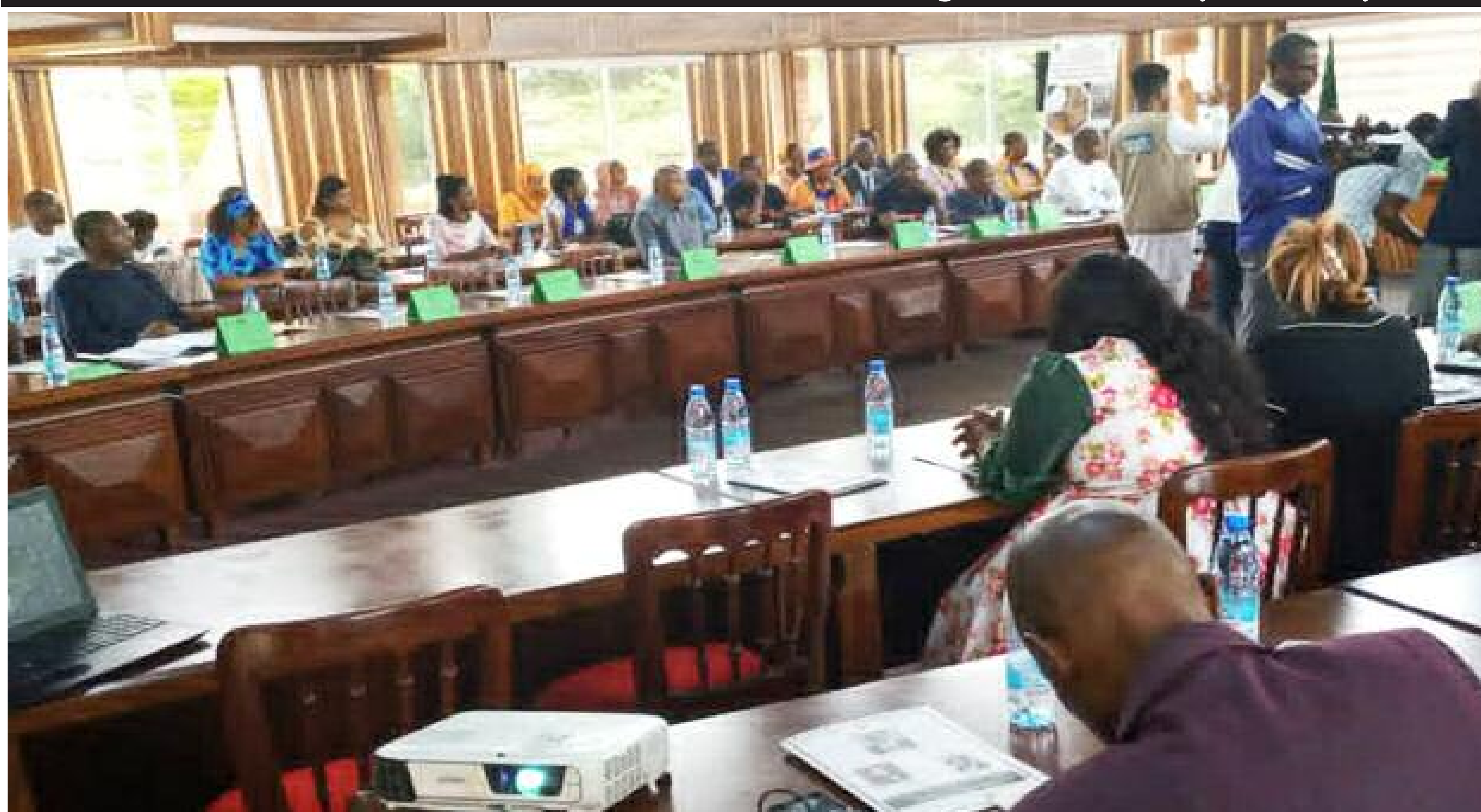
Authorities during session in Yaounde