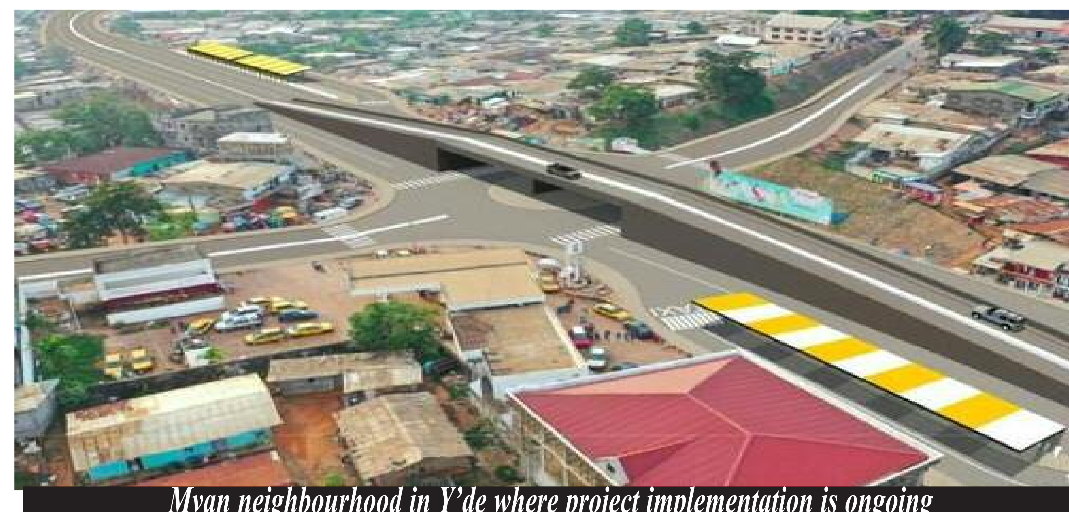
Mvan neighbourhood in Y'de where project implementation is ongoing

He quoted sources at C2D as assuring that, "studies have commenced, along with consultations. The plans are ready. We are hopeful that by the end of the year, or at the latest, in the first quarter of 2024, we will have completed the market process to expedite the work".