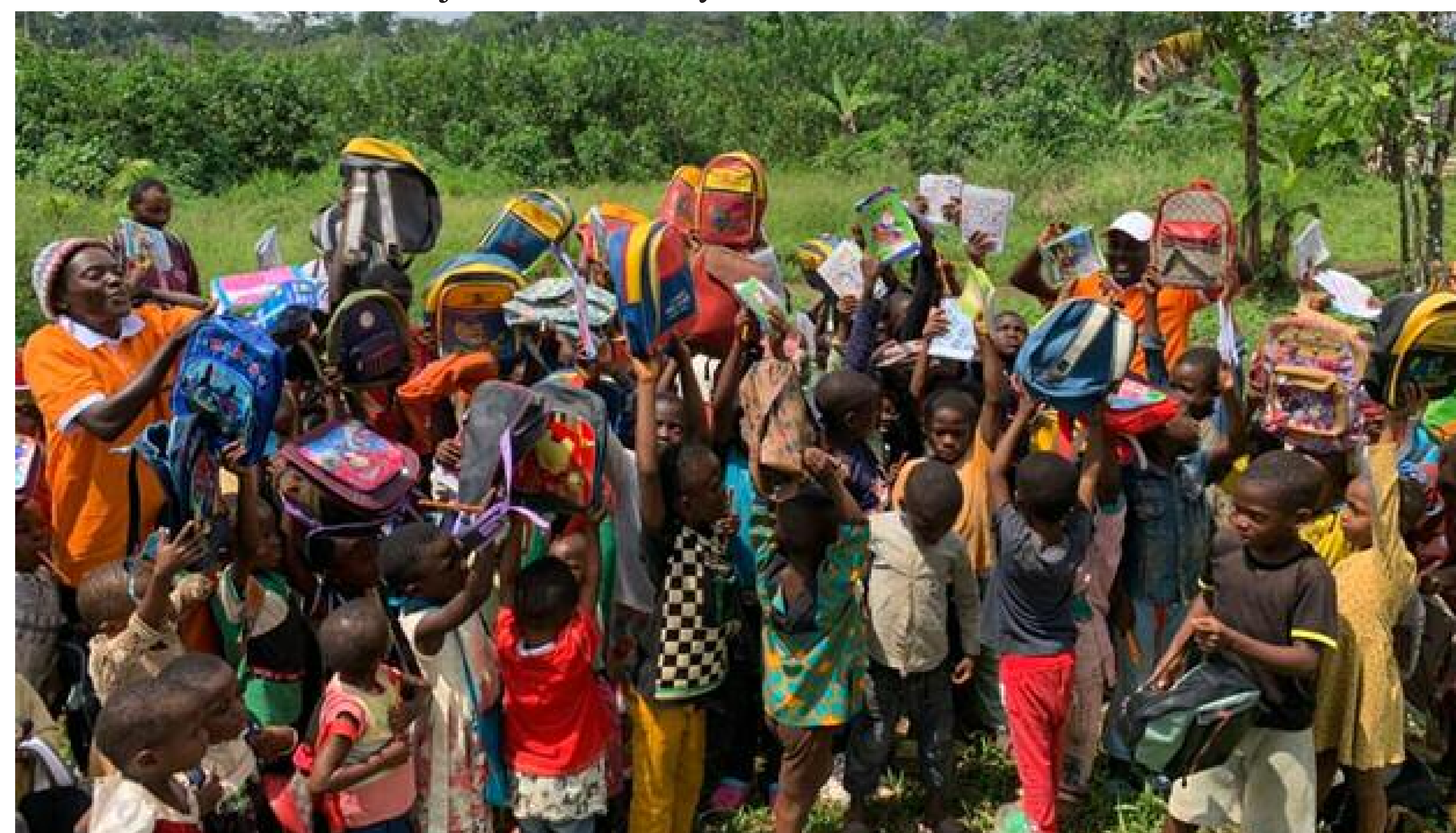
Pupils of Bombanda Community School brandish their gifts after the donation