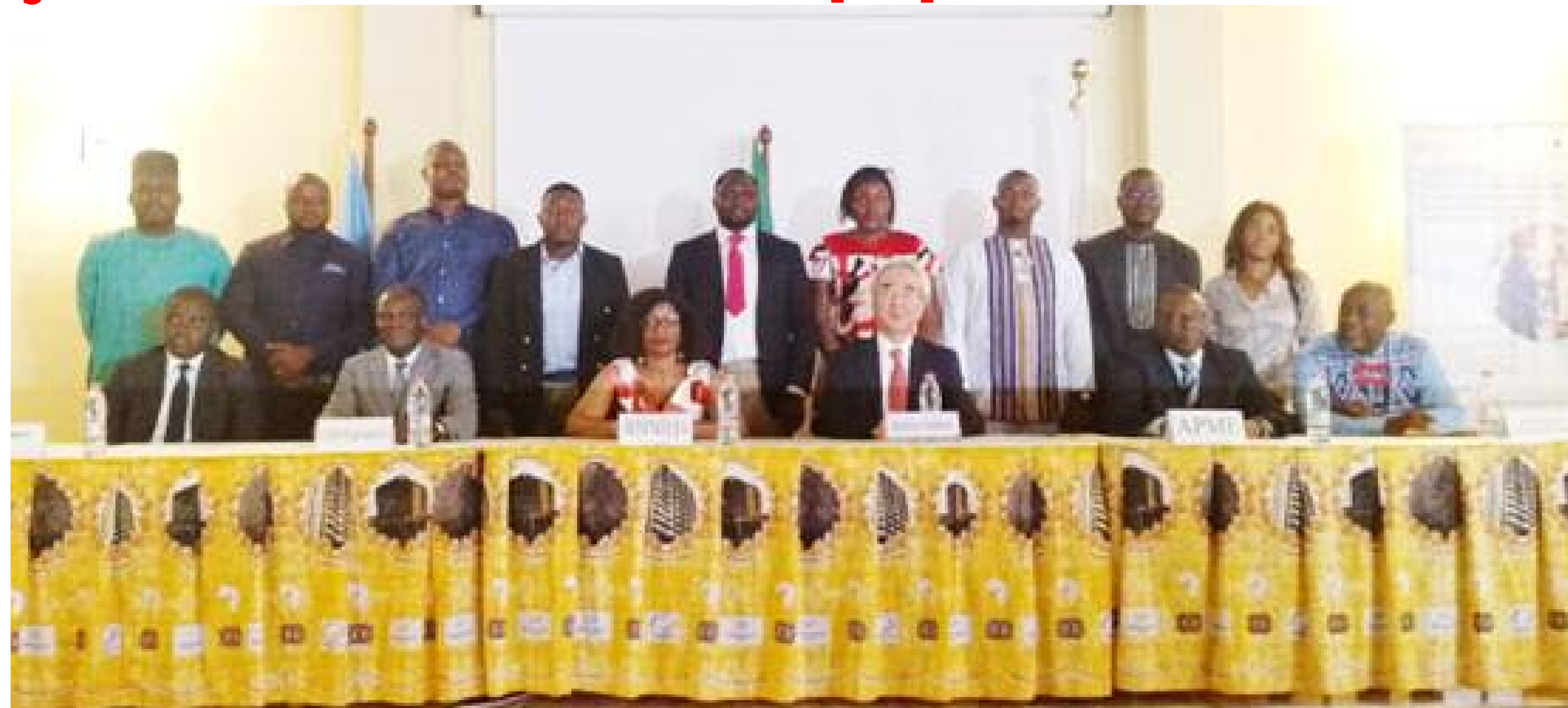
Officials, some beneficiary entrepreneurs in group photo

"I am satisfied because we have trained those companies and provided