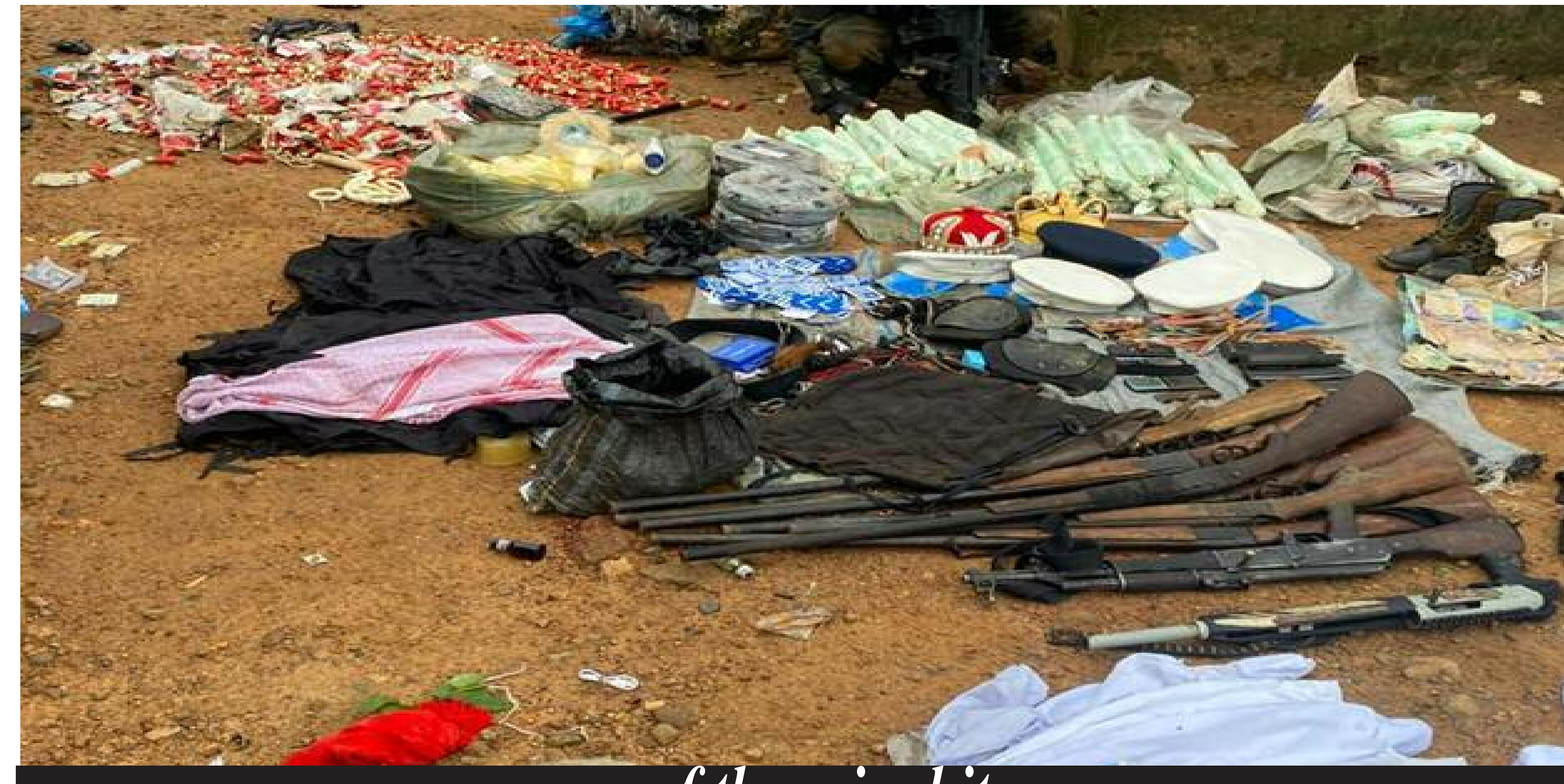
some of the seized items