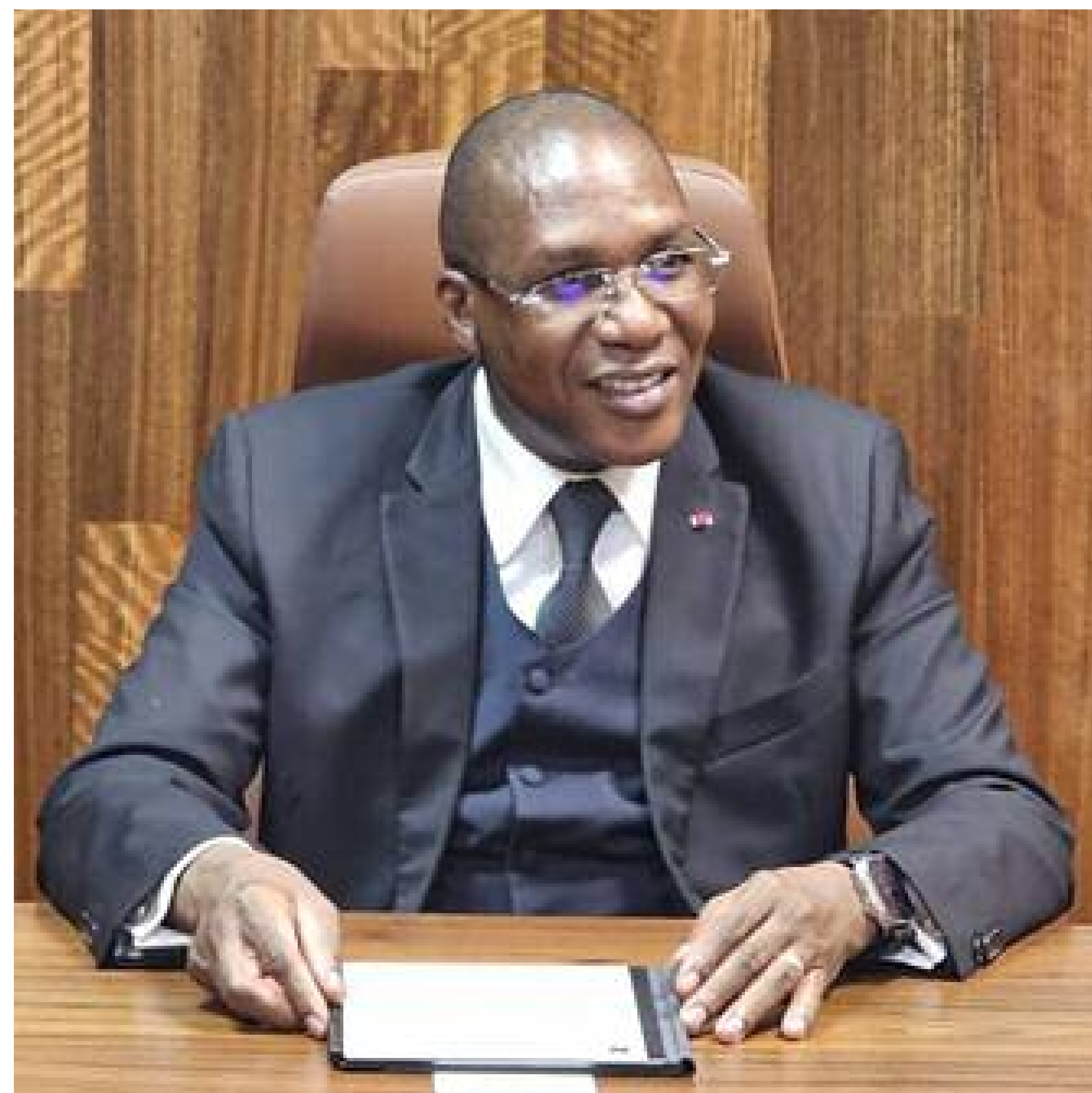
Dr Manaouda Malachie, Minister of Public Health

The Minister of Public Health, Dr Manaouda Malachie, has underscored the need for more awareness on mental health and the need to end stigmatisation against people affected by the condition.