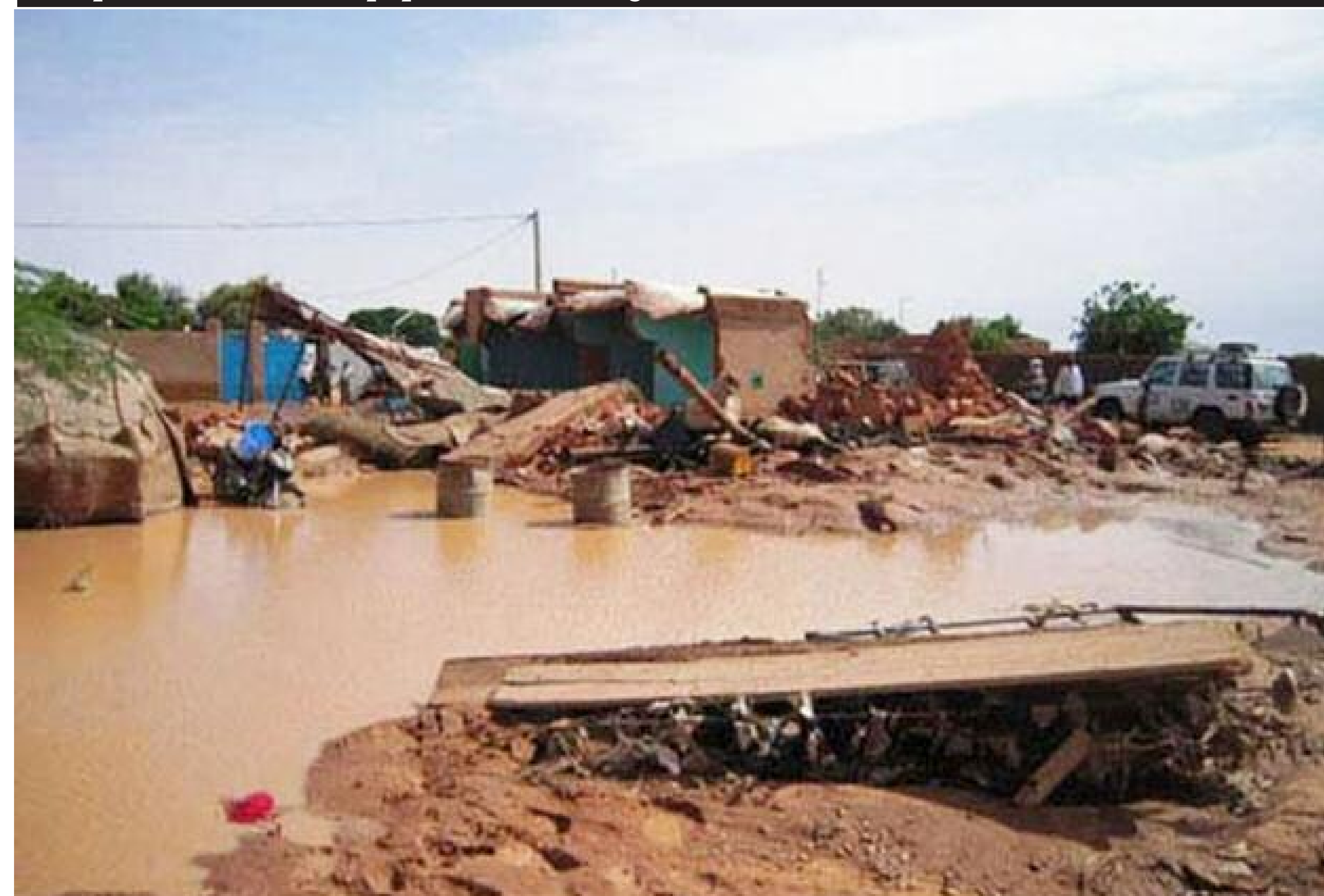
File photo of flood that destroyed property in Kousseri in the Far North Region