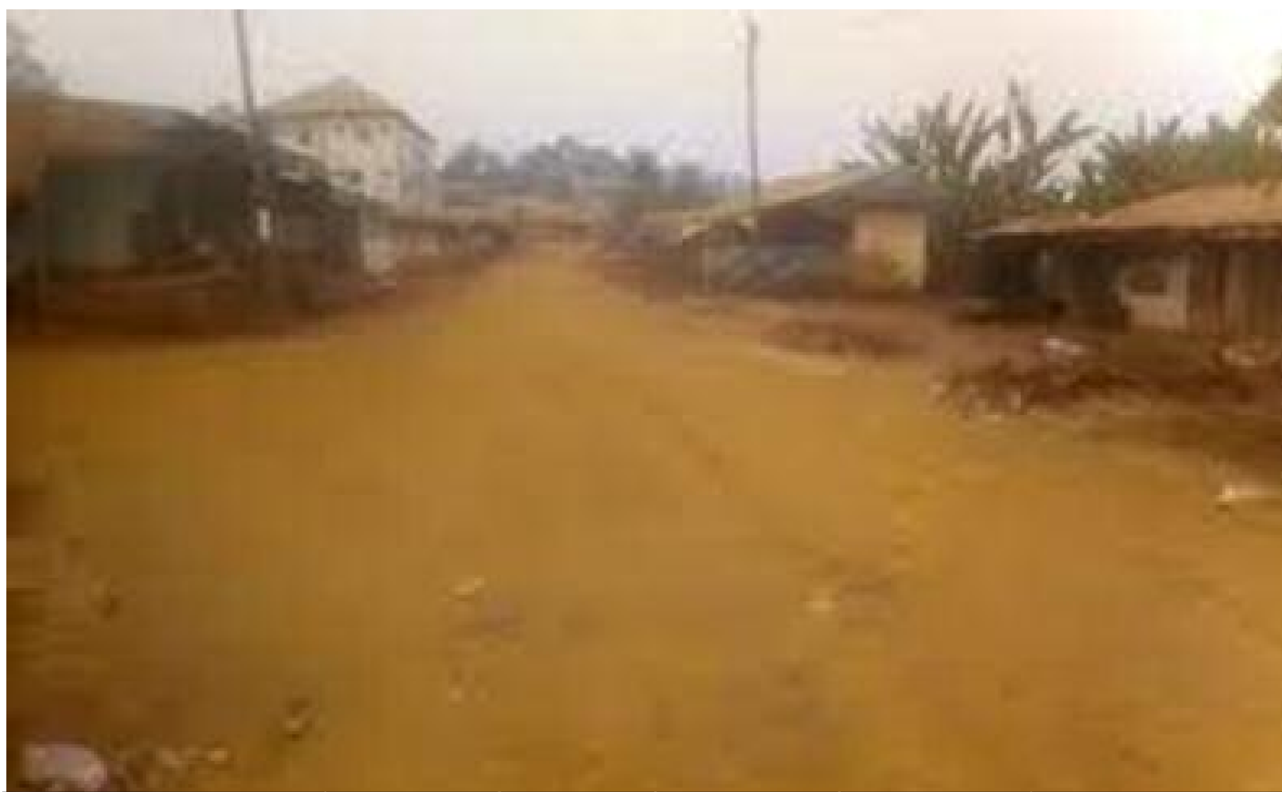
View of road to Mbengwi

at the first checkpoint at Mile 90, with a makeshift shade protected by bags of sand, the driver went to "settle" there, while the other members of my delegation were ordered out of the vehicle. I guessed as a senior citizen they allowed me to remain in the vehicle.