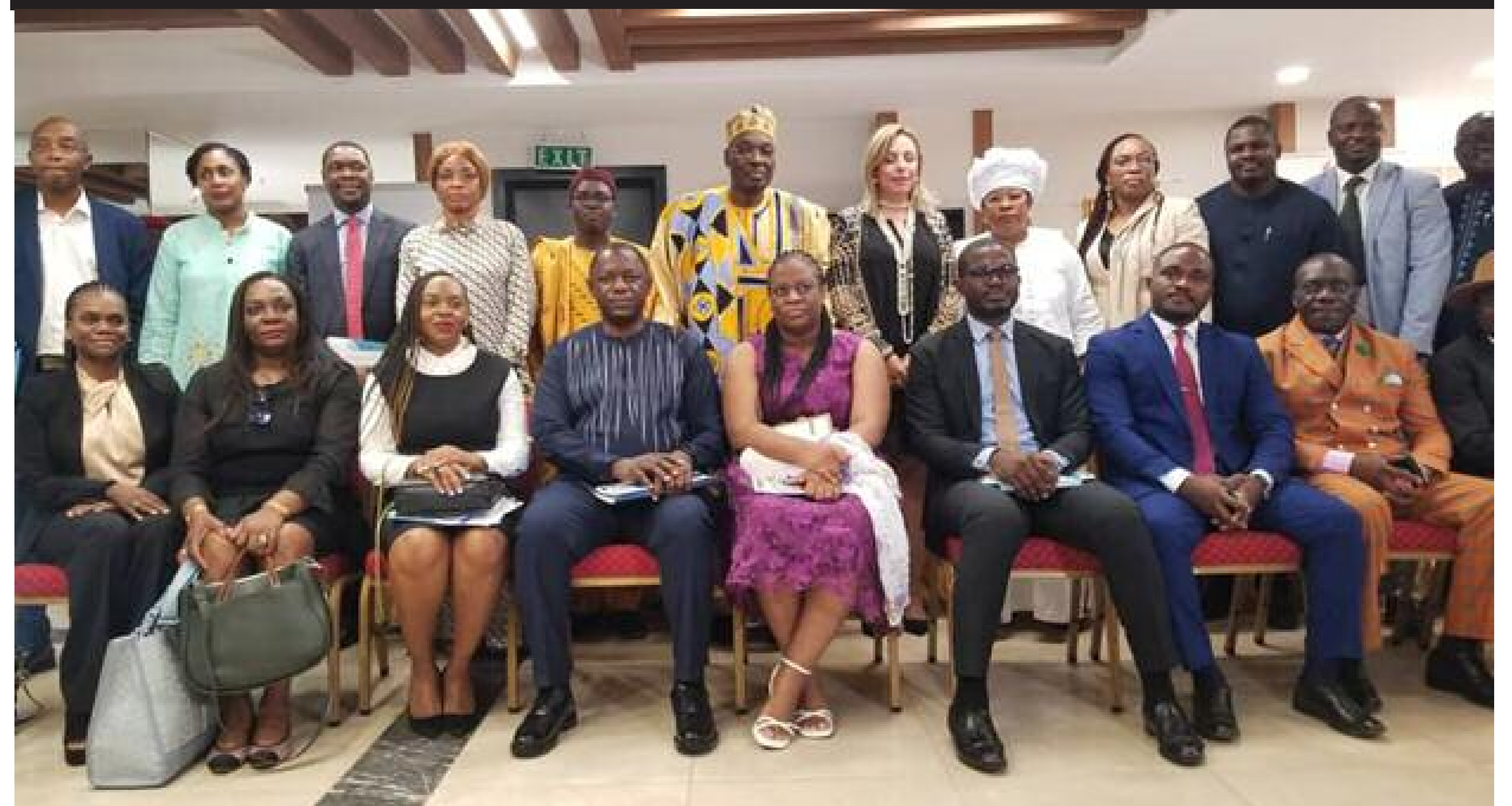
Actors in the oil industry with Minister Tchiroma and collaborators