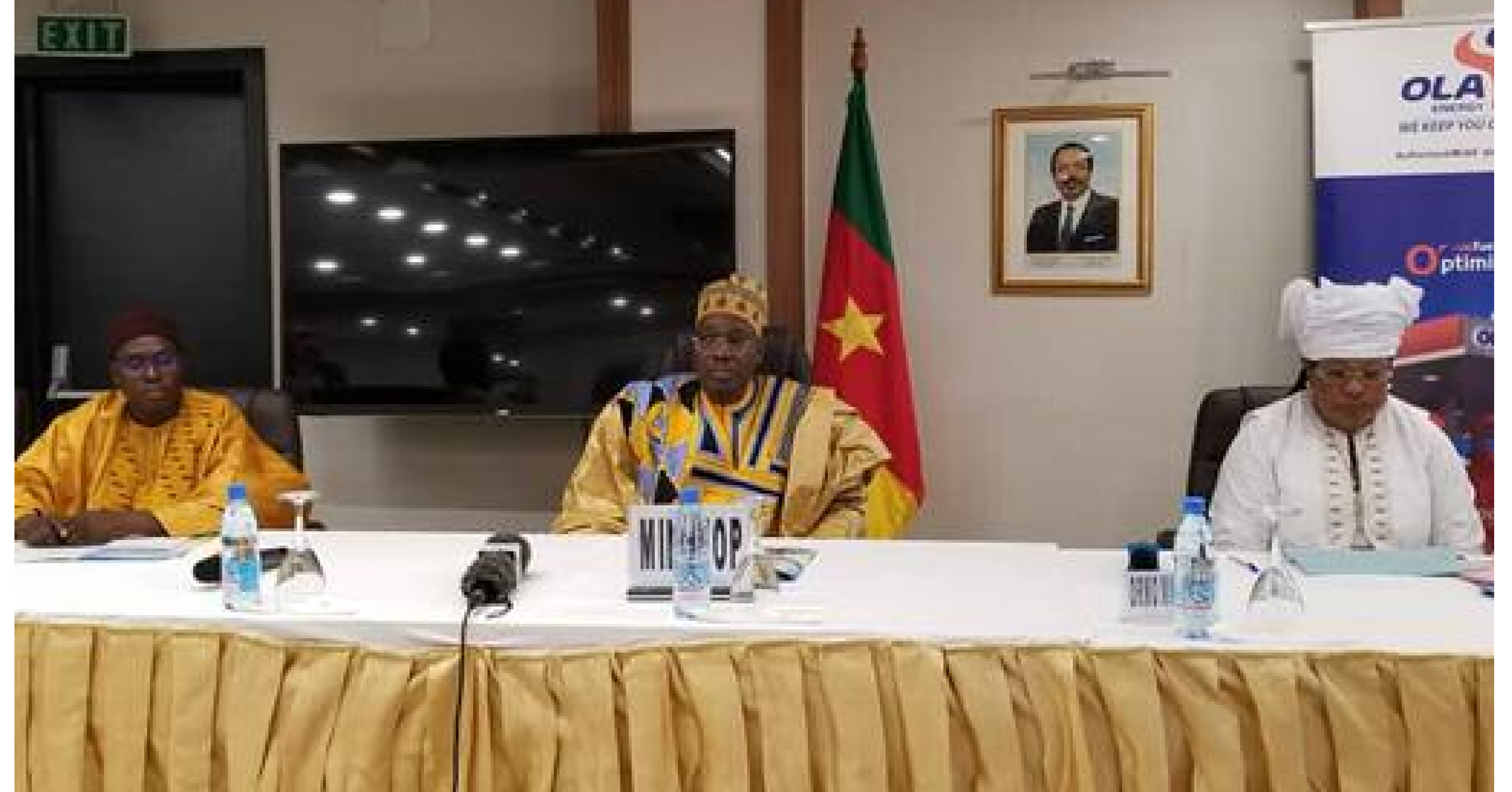
Minister Issa Tchiroma Bakary speaking during ceremony

He opined that "more than in the past, employment and vocational training must be at the heart of strategies for setting up and developing production units, particularly in the oil sector, where there is a real lack of national skills".