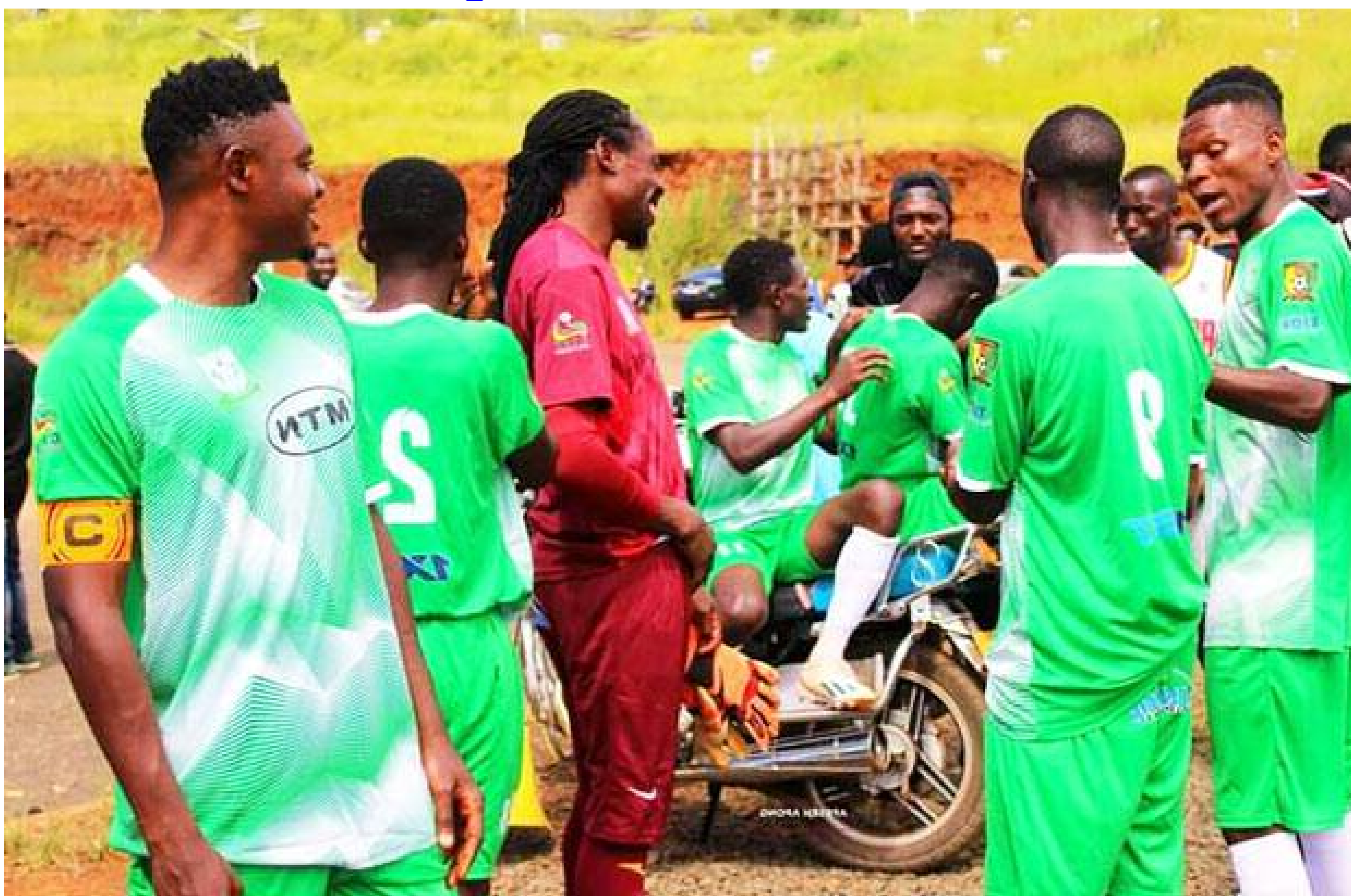
Some Bafmeng United players prior to their cancelled match against Foncha Street FC

"We applied for 24 licenses, three were rejected because the documents needed weren't complete but I've submitted them. The delay now is at the