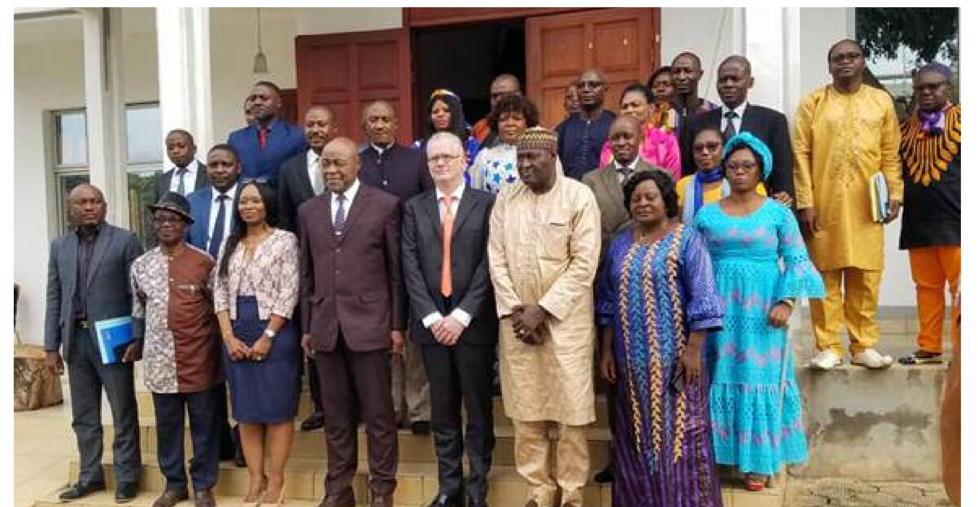
Officials pose with minister after audience to solicit support