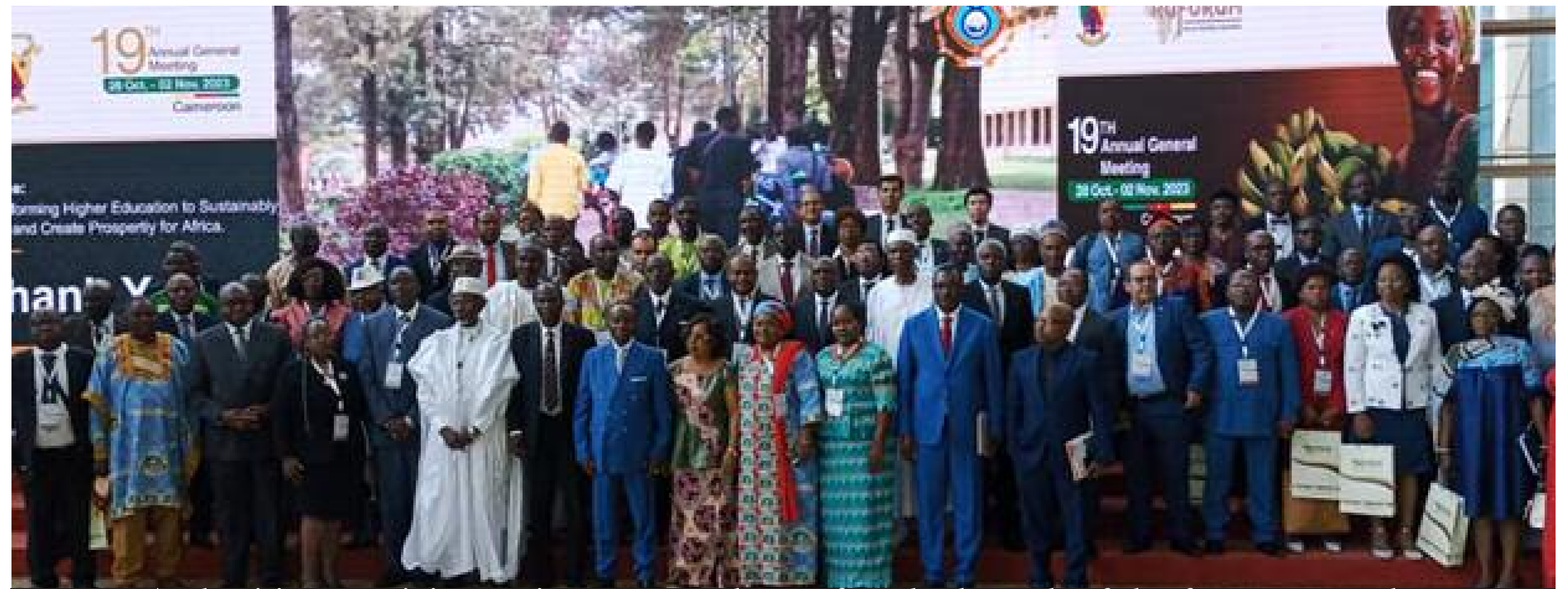
Authorities, participants in a group photo after the launch of the forum yesterday

"We should make proposals that meet the requirements of the African continent. This is a turning point for the African continent. Let's think big and