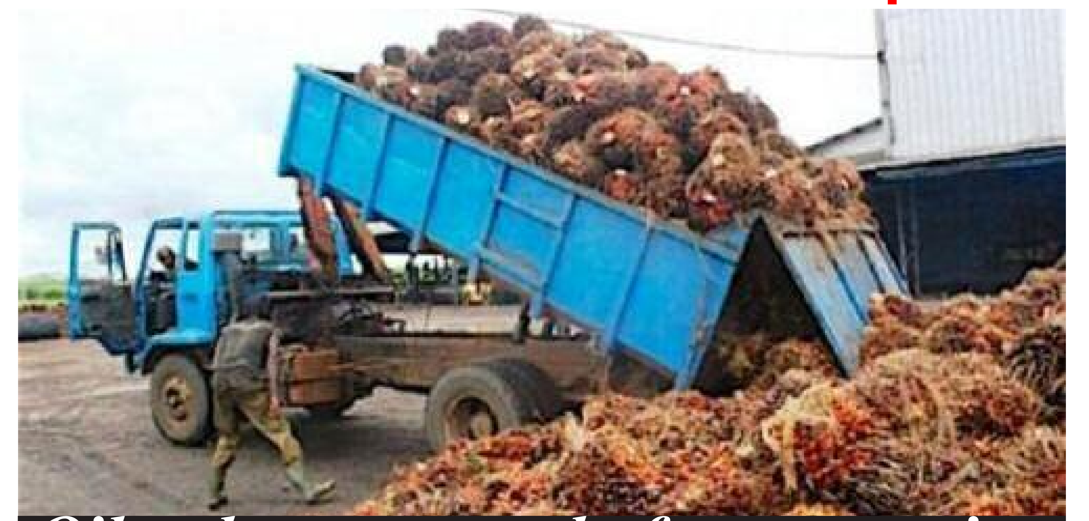
Oil palm nuts ready for processing

"We've witnessed a significant surge in the costs of agricultural inputs, production factors, and land rents, as have many companies. However, our ability to maintain these results can be attributed to our rigorous management of