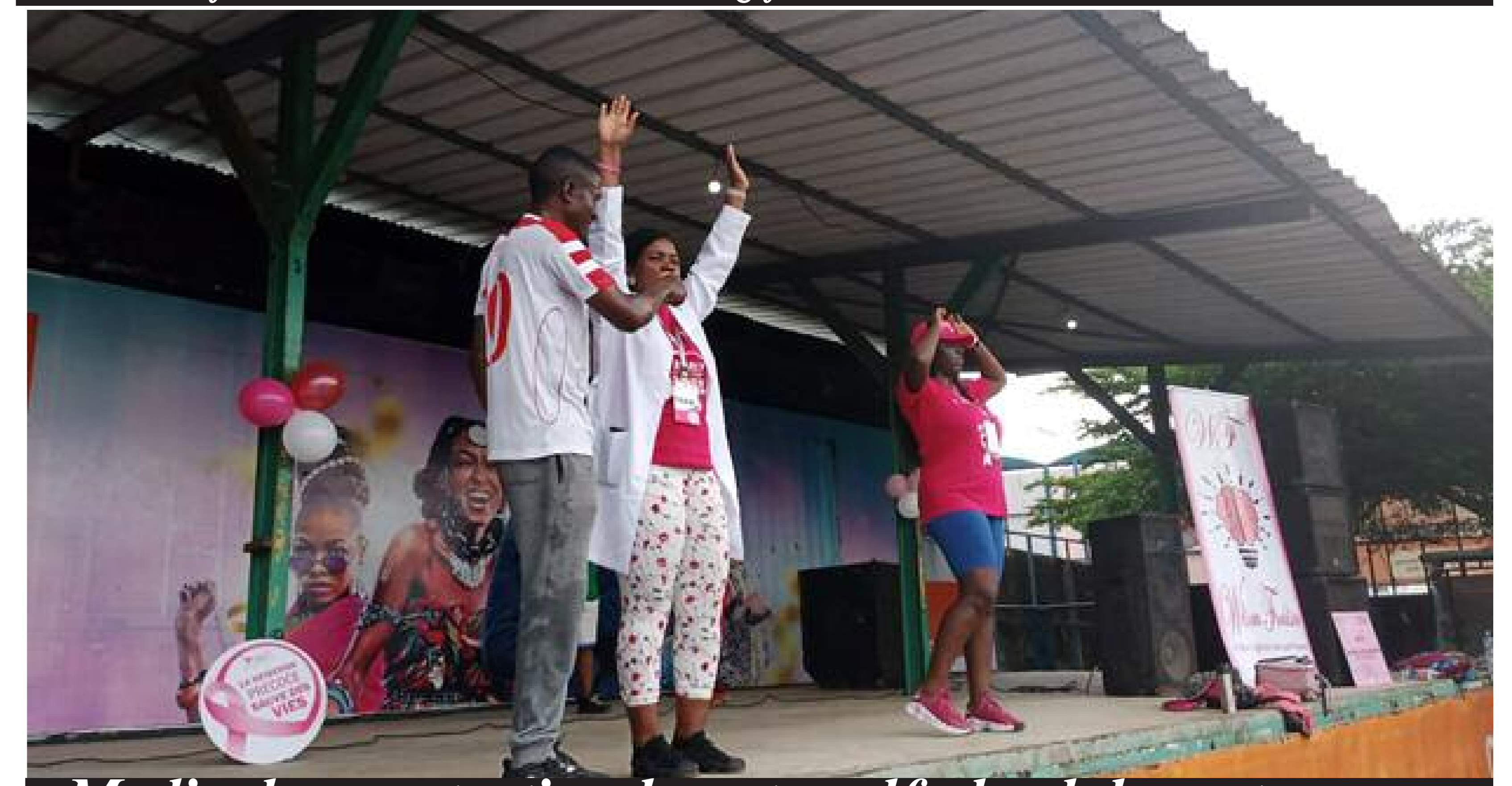
Medic demonstrating how to self-check breast cancer

around the armpit, abnormal discharge on the nipples etc.