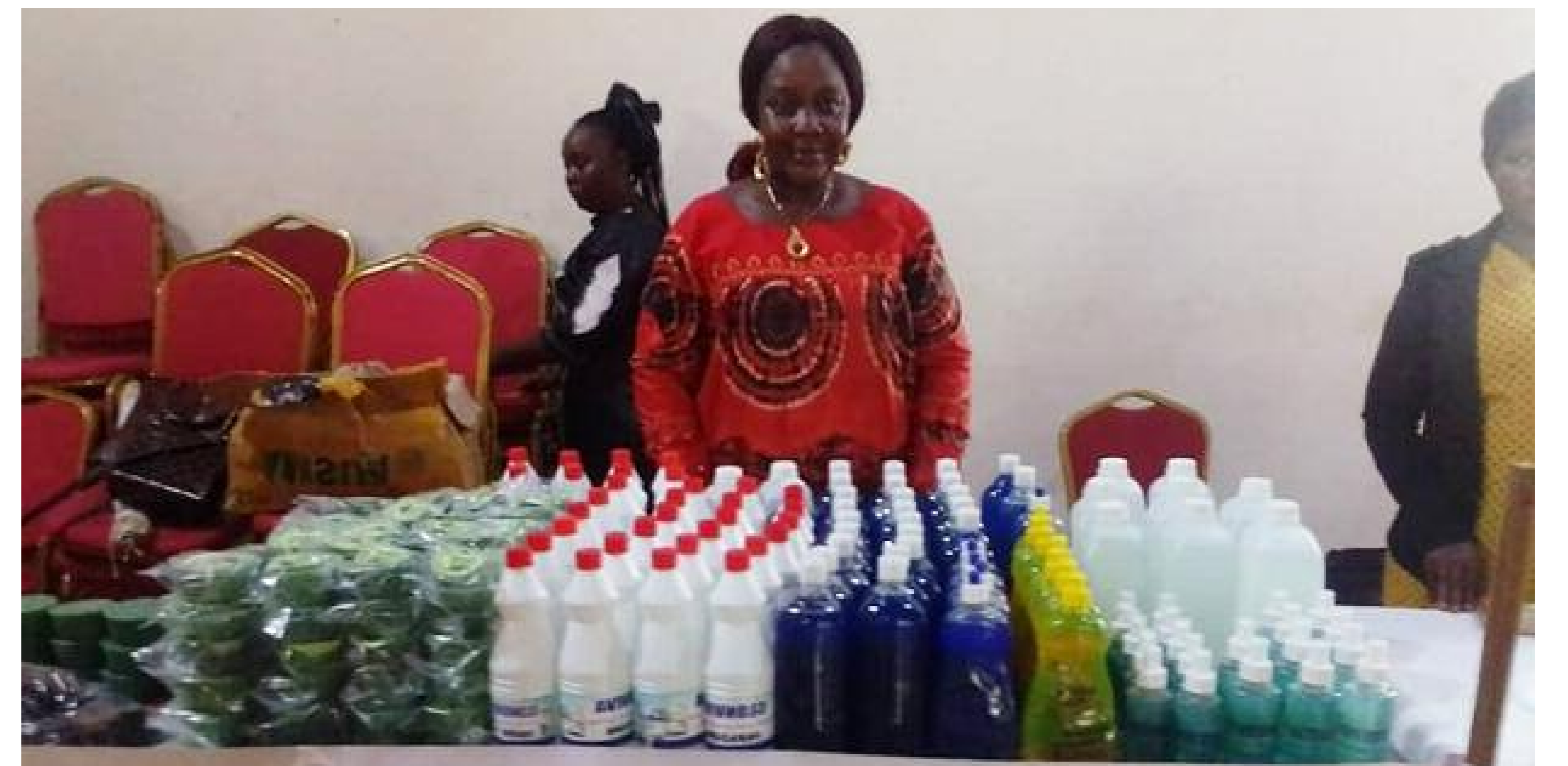
Some exhibitors during the Divisional fair

positive image on the Gross Domestic product, GDP of the nation.