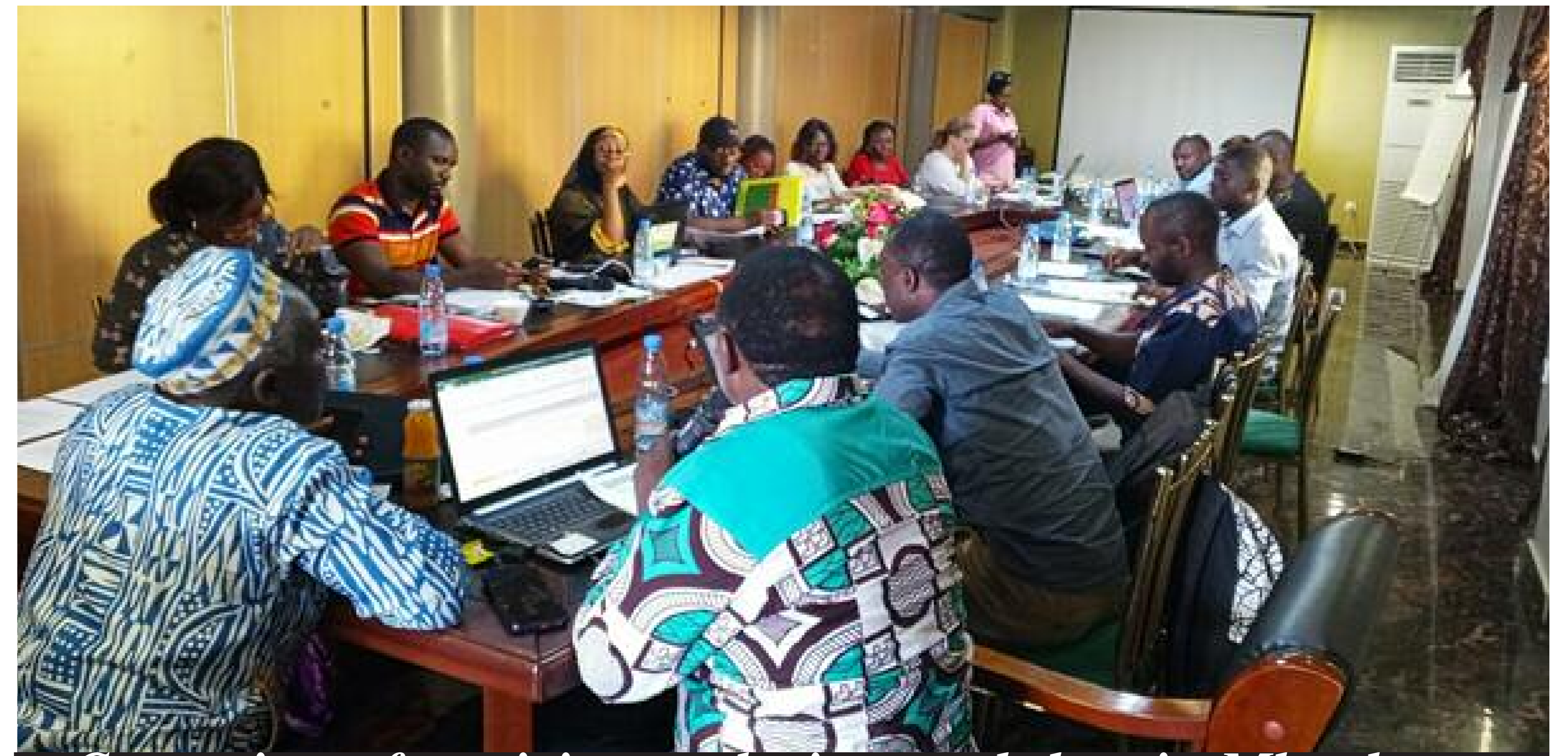
Cross view of participants during workshop in Mbankomo

At the end of the training, the journalists on their part, pledged to apply the