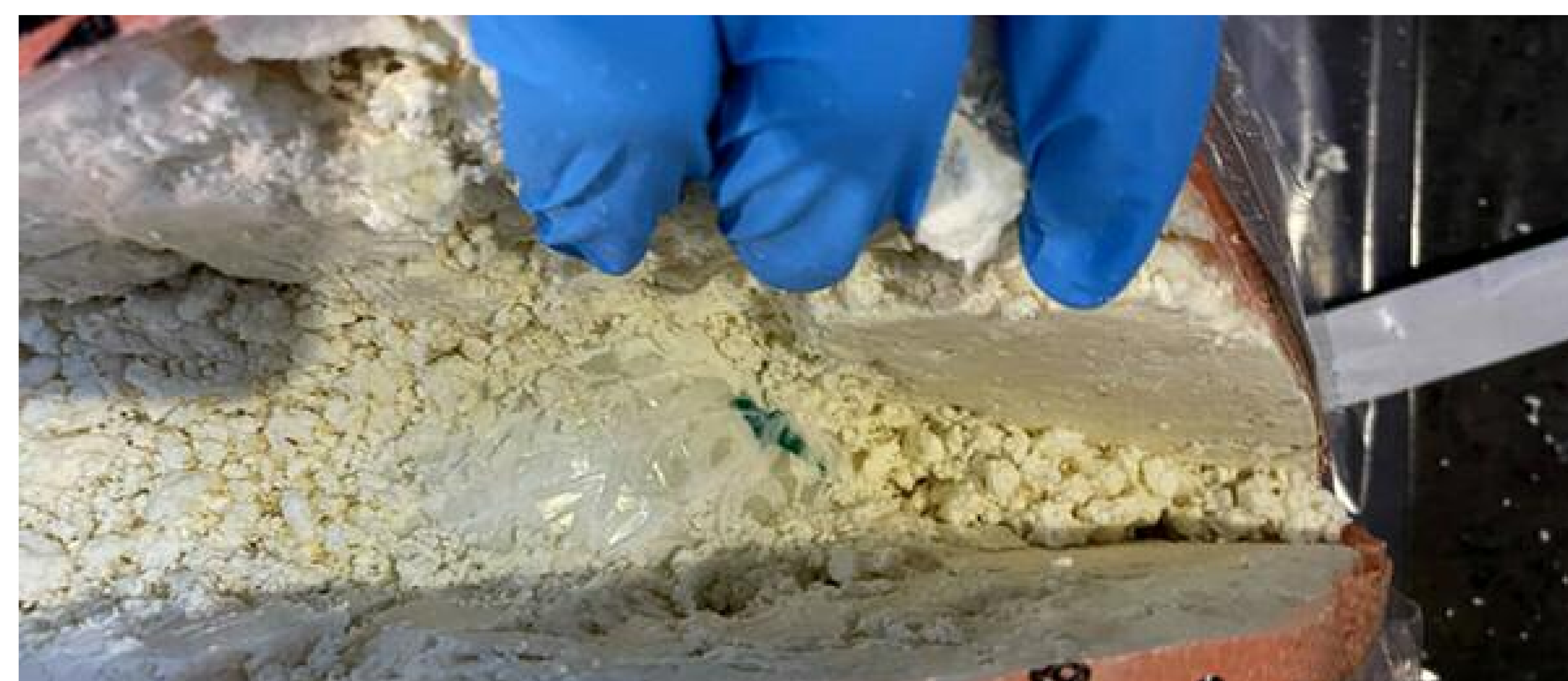
Ketamine found in cargo shipment at Washington Dulles International Airport