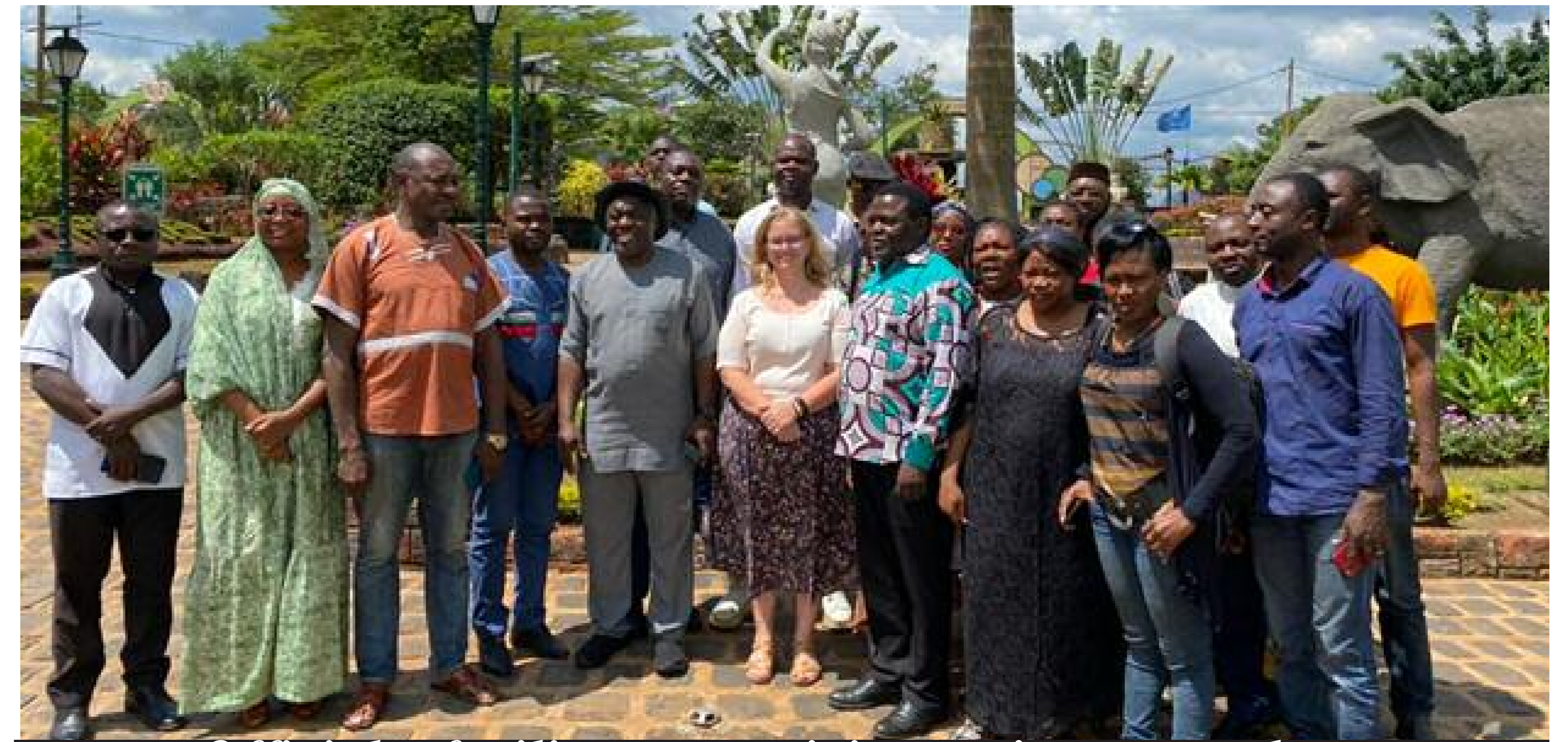
Officials, facilitator, participants in group photo

lessons acquired during the training to better inform and educate the population to adopt behavioural change in line with the global fight against malaria as well as to inform policy-makers to take informed decisions for the interest of the general good.