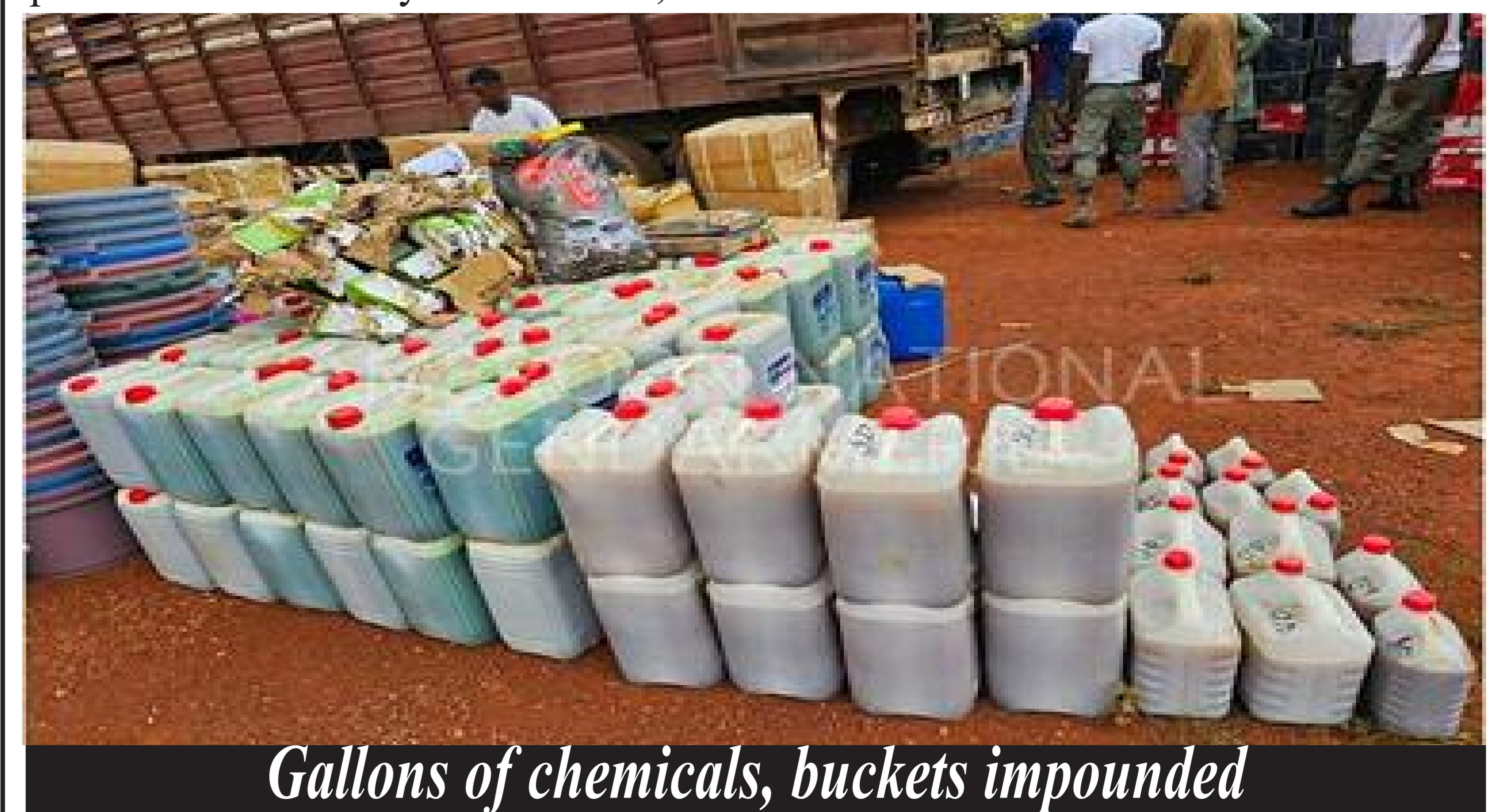
Gallons of chemicals, buckets impounded

To recall that, some months back, unidentified persons used projects to attack vehicles along the Yaounde-Douala road. The situation caused the Minister of Territorial Administration, Paul Atanga Nji to organise emergency meetings to arrest the situation.