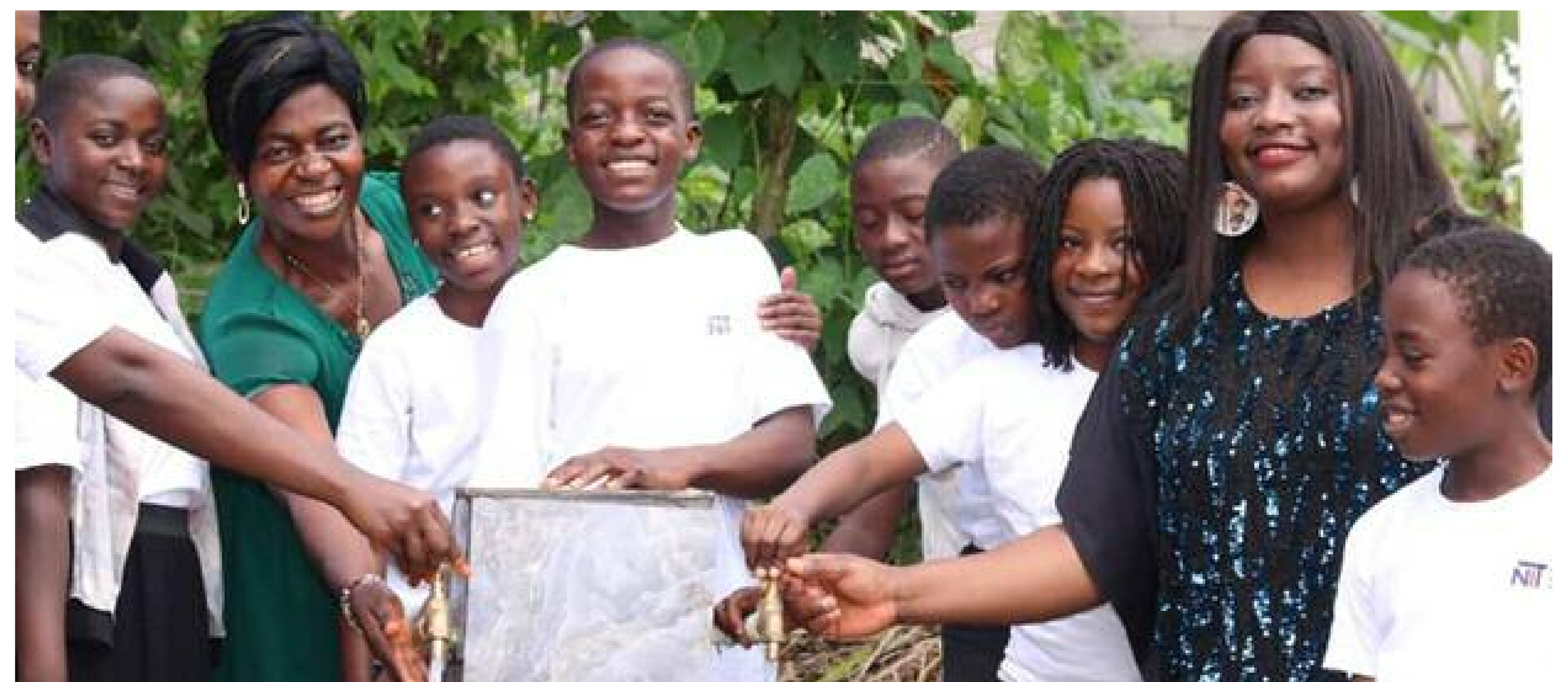
Members of the foundation at one of the donated stand taps

"In the face of daunting challenges, the NDES Foundation's commitment to improving the lives of the people it serves shines as a beacon of hope. This event marks the beginning of a brighter future for these communities in Buea, where access to clean water is no longer a distant dream but a tangible reality, thanks to the power of local action and community development," the organisation continued.