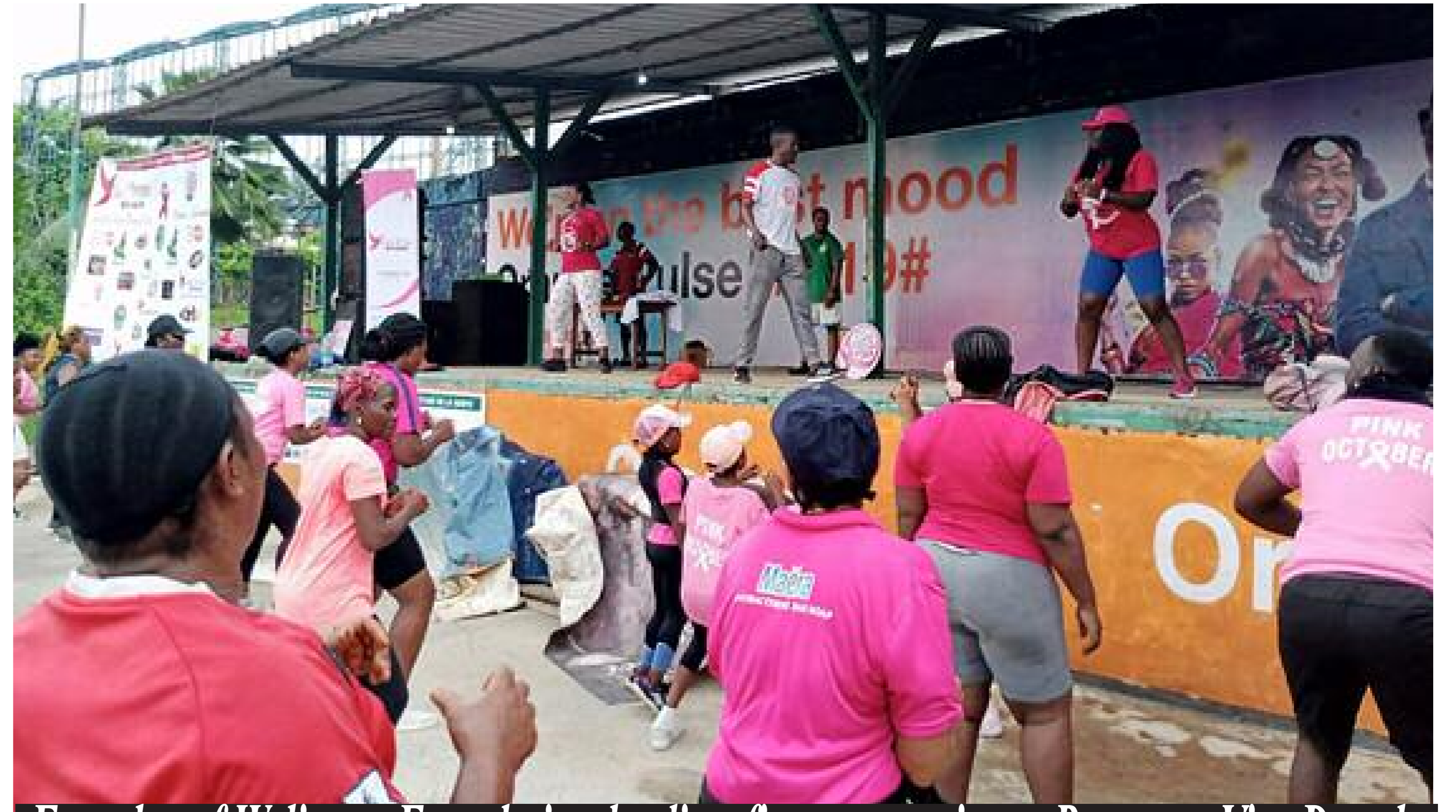
Founder of Welisane Foundation leading fitness exercise at Parcours Vita-Douala

Symptoms to watch out for, she said, are noddles, boils, abnormal pains, inverted nipples for people who were not born with inverted nipples... orange peels skin, flaky skin around the breast area, noddles