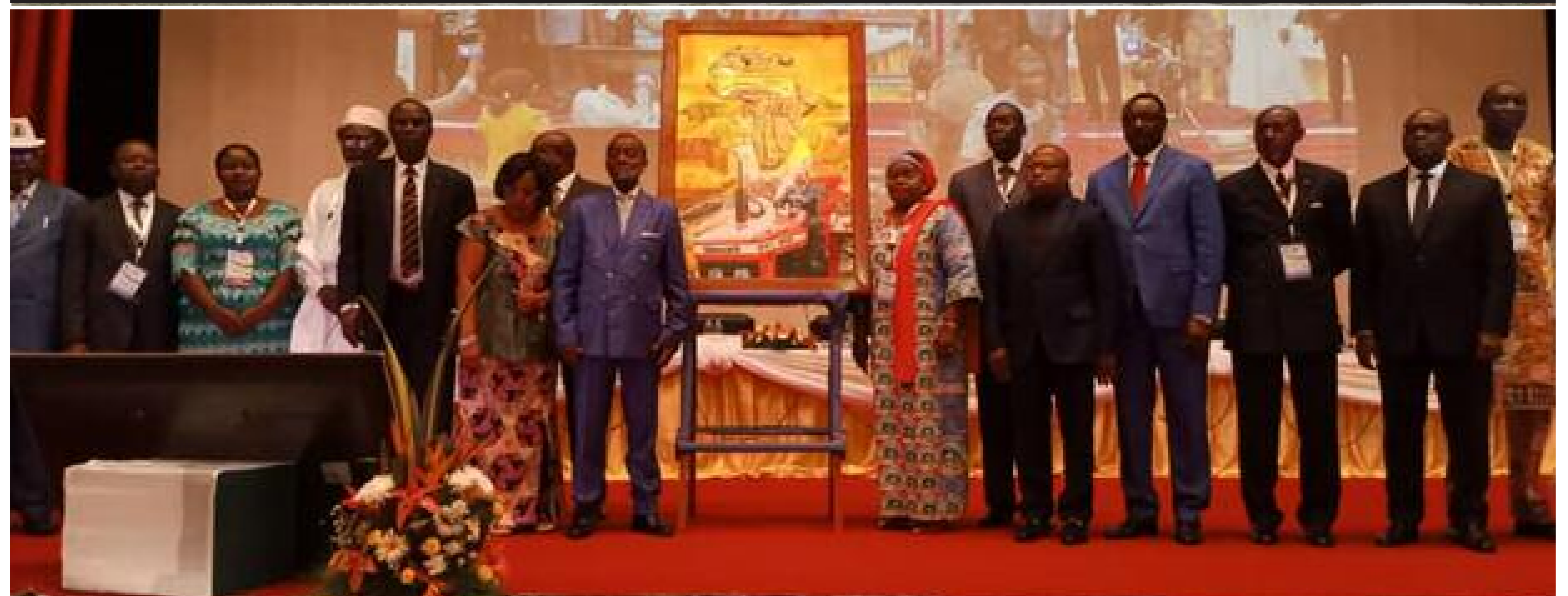
Officials pose with a special ROFURUM award handed to President Paul Biya for his contributions to agriculture in Africa

have the courage to dream big," the member of government emphasised.