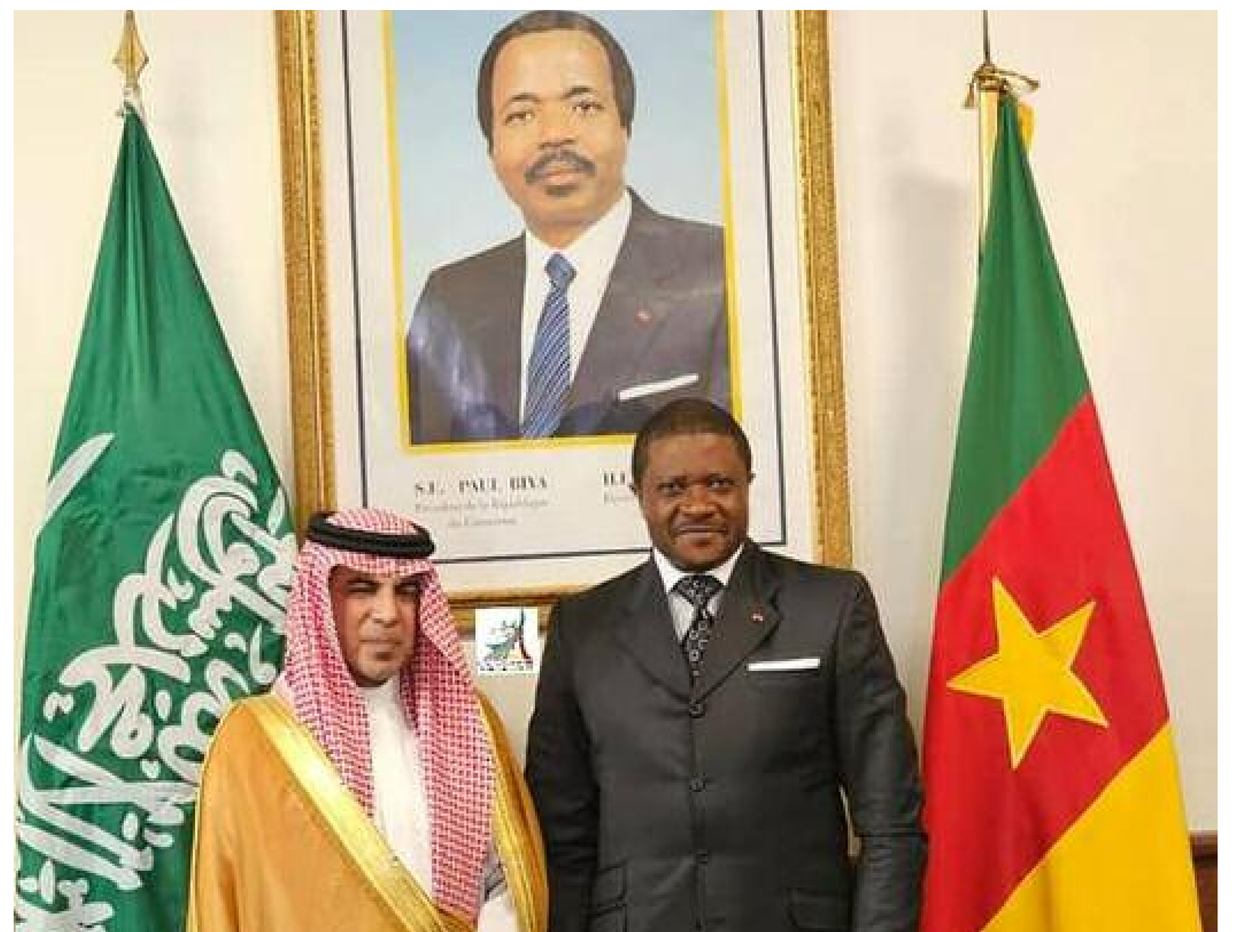
Saudi Ambassador poses with Transport minister

For instance, the Director of Road Transport focused his presentation on the development of inter-urban transportation in the ten regions of the country, while the Director of Railway Transport spoke about the development and exten-