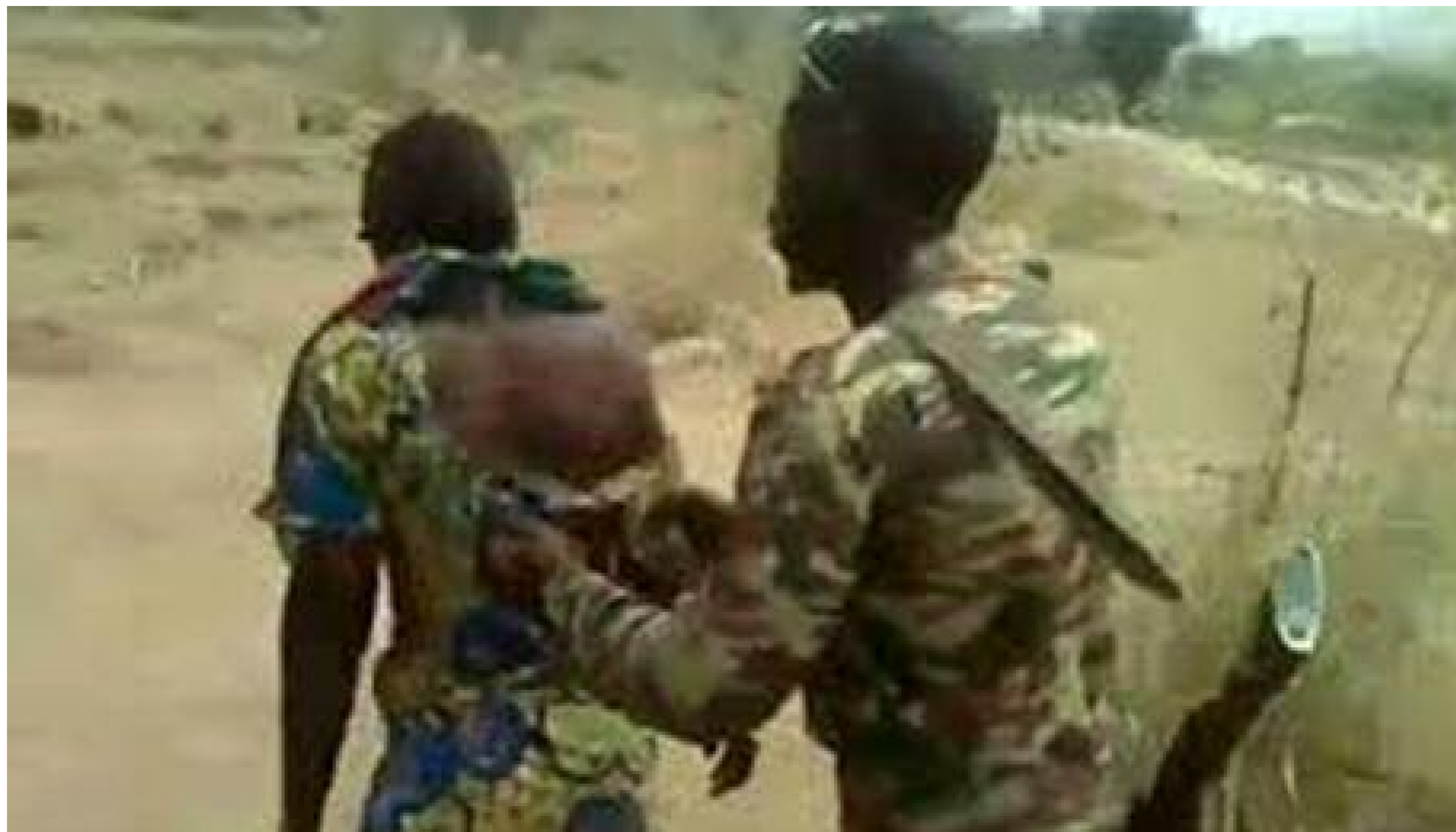
File photo: Soldier about to publicly execute woman in Far North

In 2023, 59 percent of the surveyed countries experienced a decline in the rule of law. On a global scale, Denmark secured the top spot in the 2023 WJP Rule of Law Index, followed by