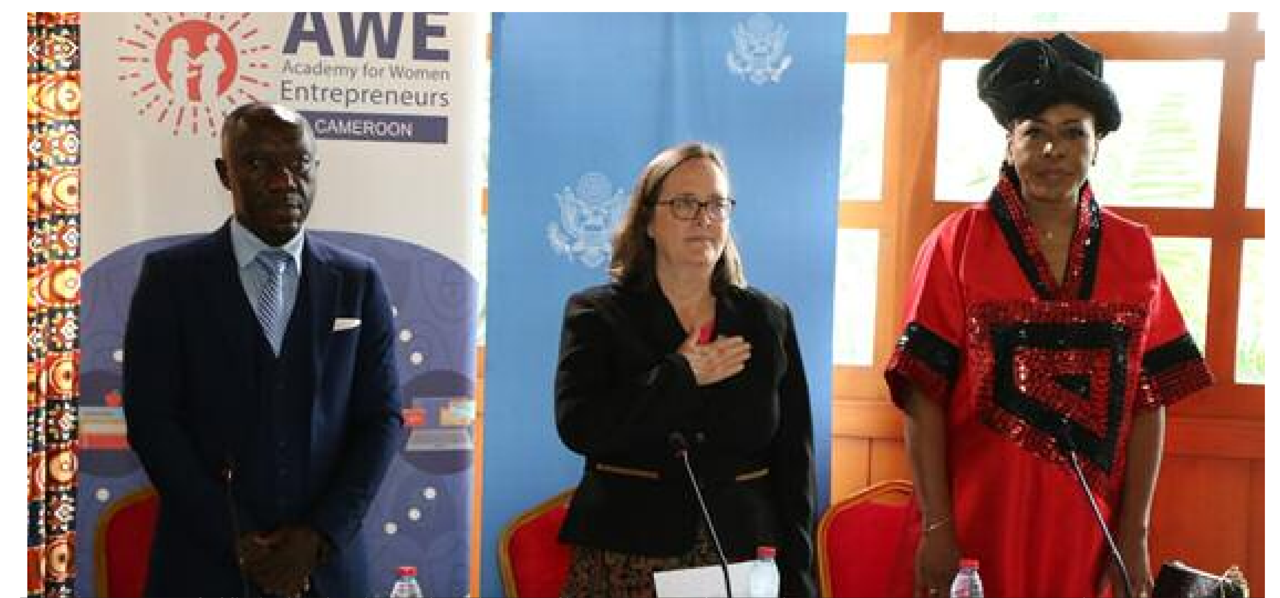
Officials during the AWE-Cameroon launch ceremony in Yaounde