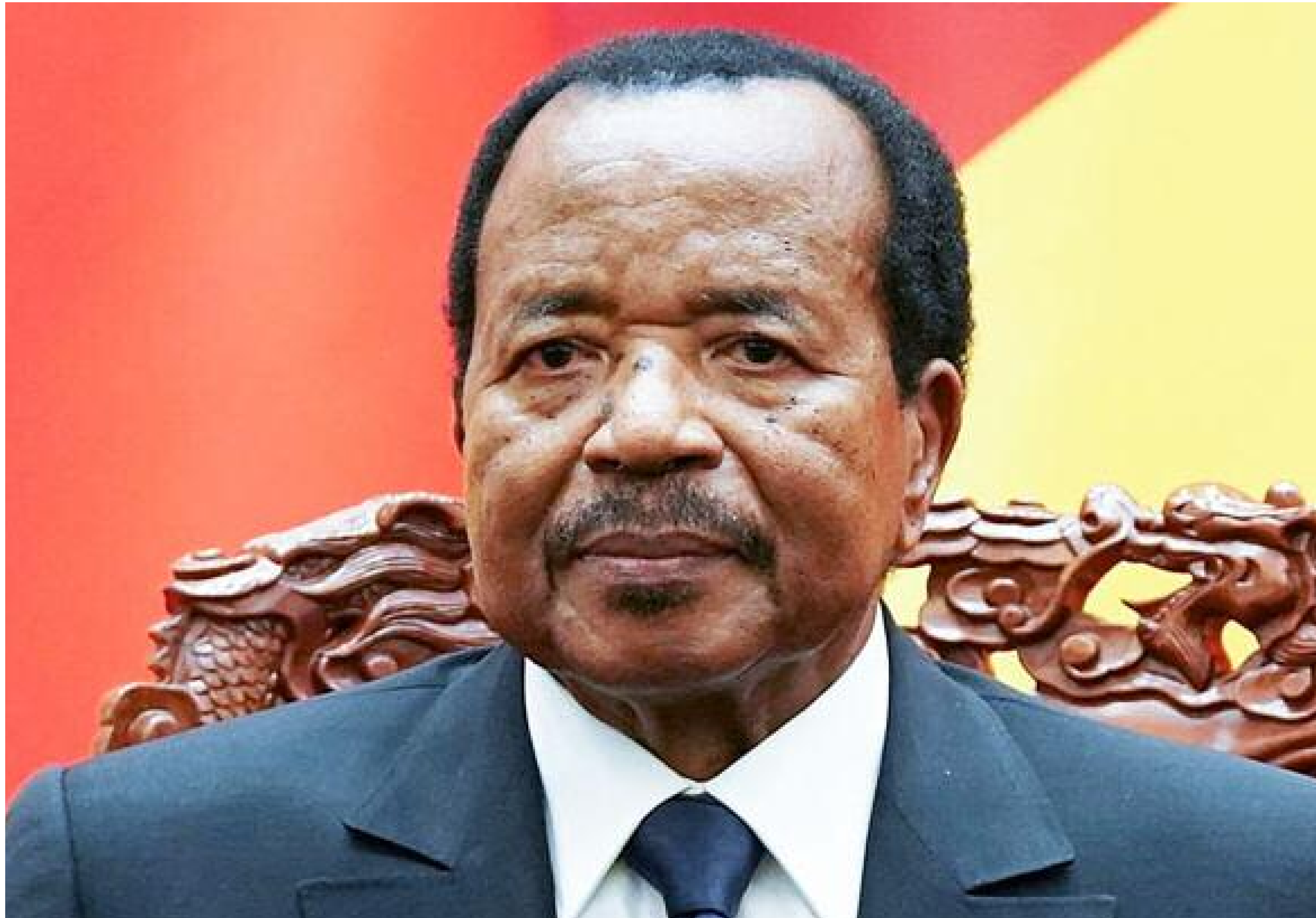
President Paul Biya: What road network balance sheet for Yaounde, 41 years in power?

covered Yaounde through bad roads has not spared even the neighbourhood where the President of the Republic, Paul Biya, lives. Here, we are talking about the Etoudi Marche area and Etoudi Canal 2 roads; both, just a stone throw from the Unity Palace.