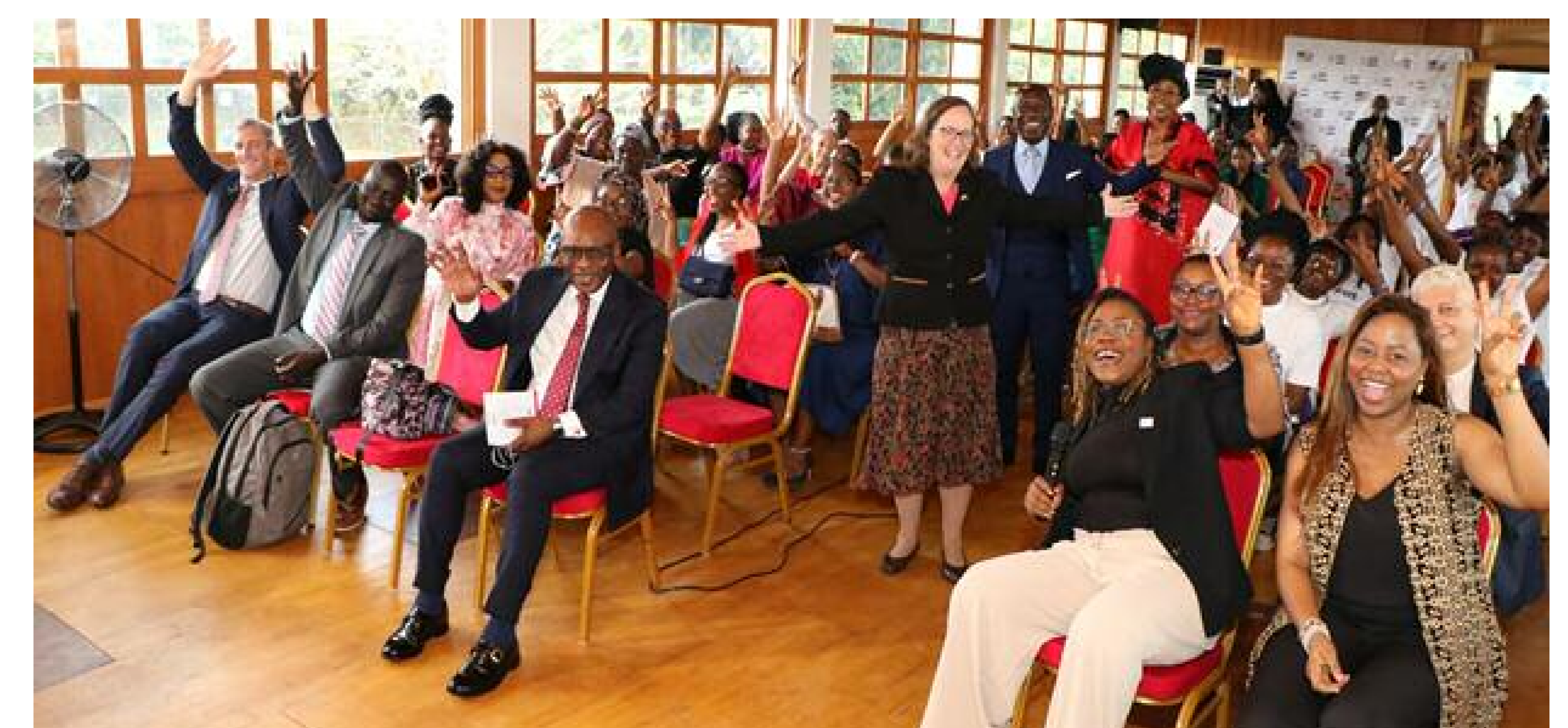
Officials, pioneer AWE-Cameroon cohorts during launch