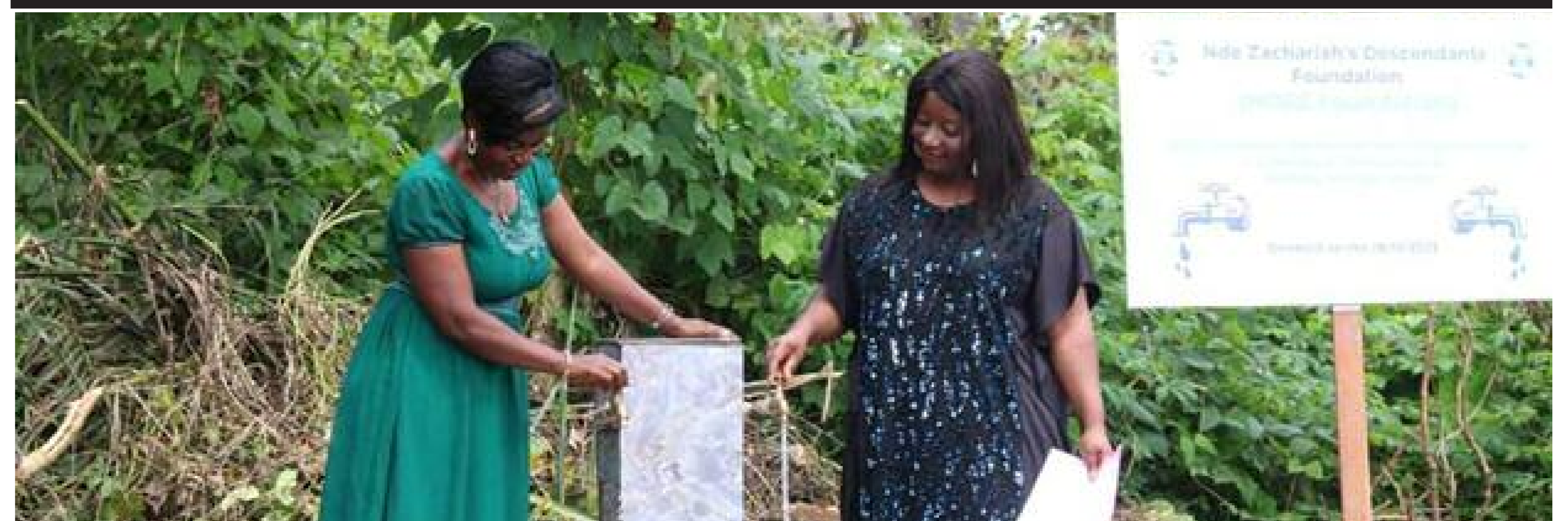
Representatives of the Foundation at the inaugural