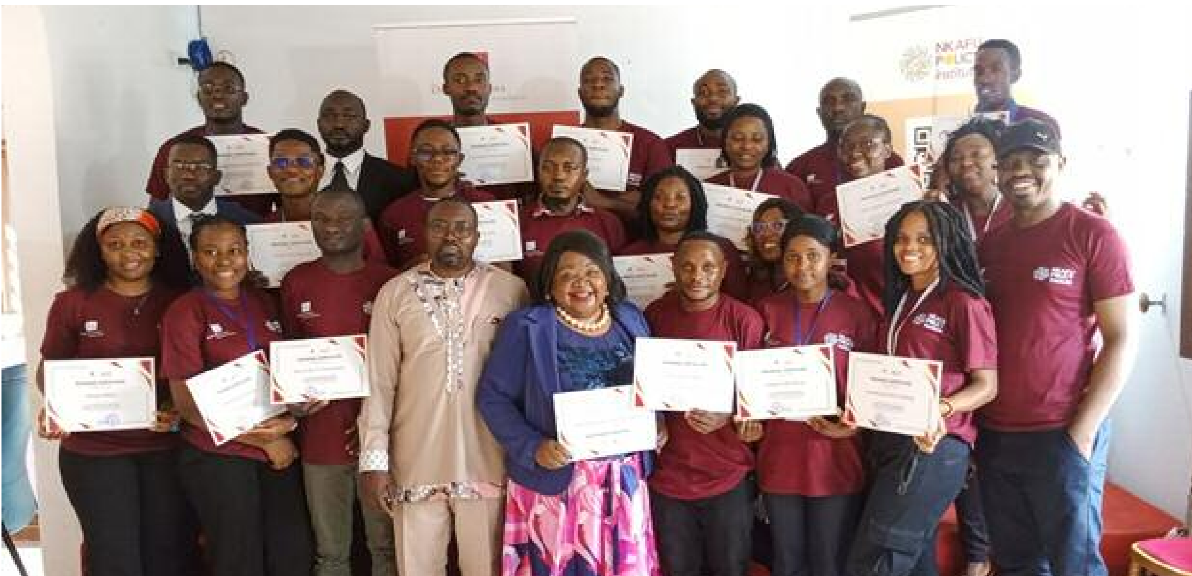
Participants, authorities at the end of the training last Friday

cy making and implementation and contribute in the continuous and steady development of Cameroon through the promotion of people and result-oriented policies.